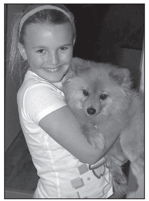
Freddy and Friends.

life and they are sure to make a difference in yours.