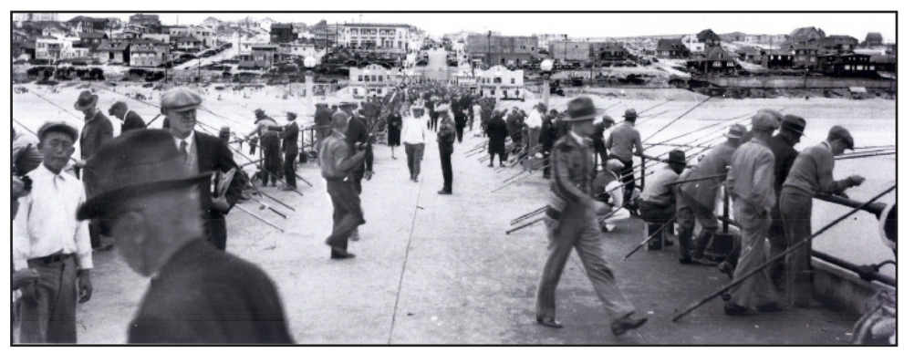
DuringtheDepression,hundredsofpeoplefoundrelaxationandenjoymentfromeverydayproblems,whilefishingorjuststrolling on the Manhattan Beach Pier.