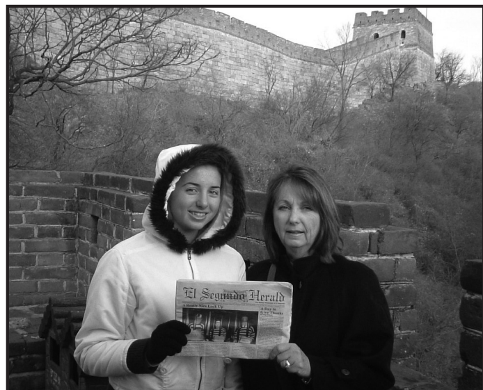
"We were the only tourists on the Great Wall during the wee cold hours of the morning."