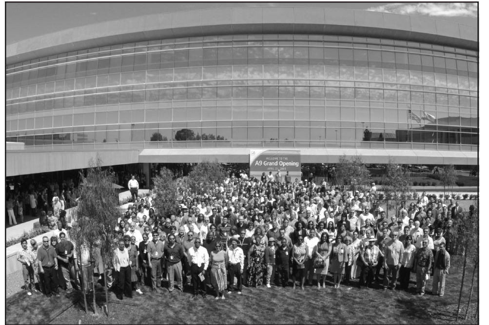
A large crowd of dignitaries, visitors and employees attend the Grand Opening of Building A9.