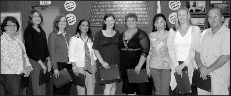
Some of the recipients of the District Service Award for ten years of service.