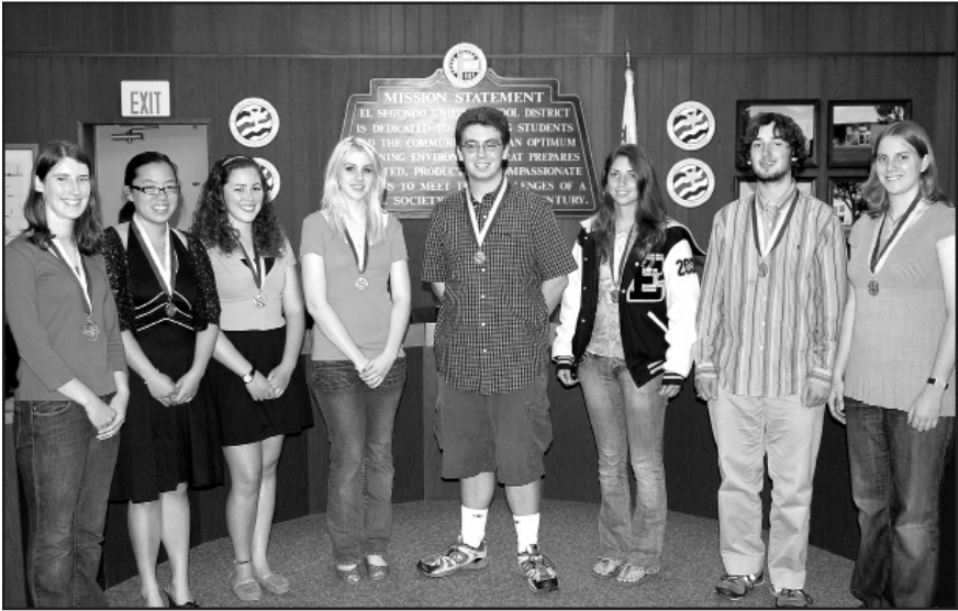
Eight of the El Segundo High School Academic Top Ten Award Honorees.