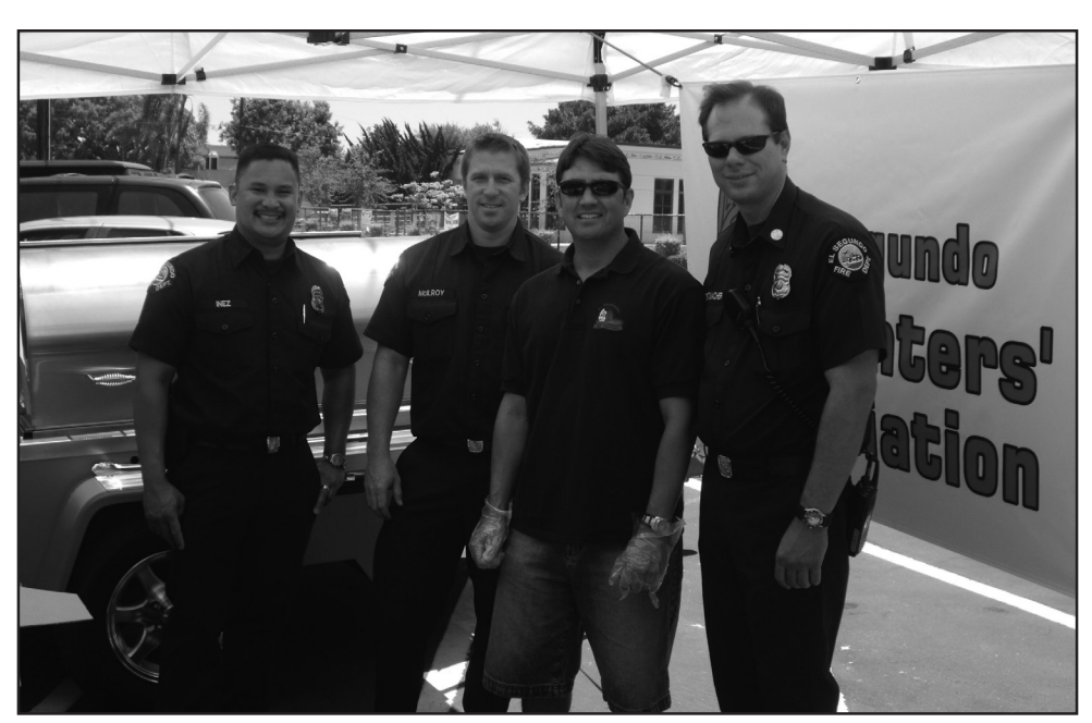
The volunteers from the El Segundo Firefighters' Association that were fire-manning the BBQ stand.