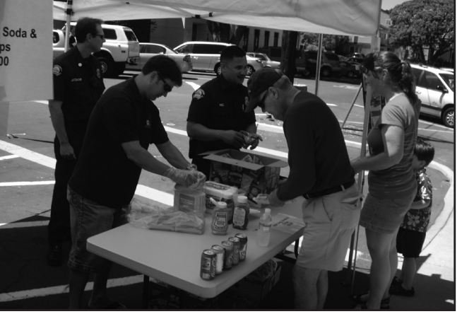
The El Segundo Firefighters' Association serves food to hungry concertgoers.