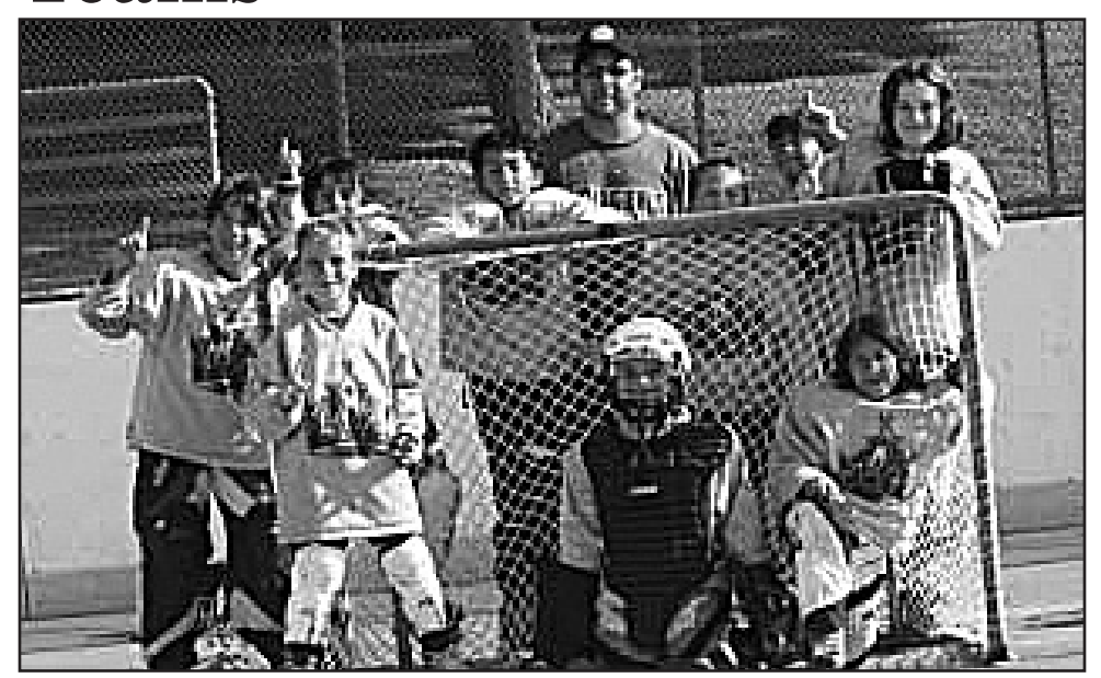
The Silver Bullets celebrate their championship.