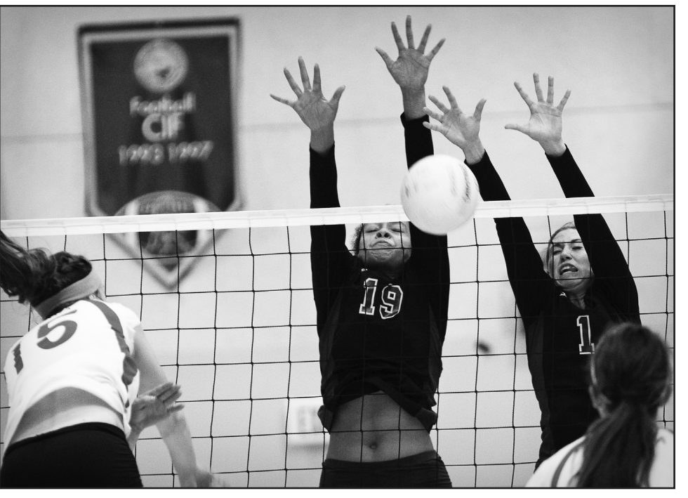
Fonoimoana and McBride team up to foil Redondo kill.