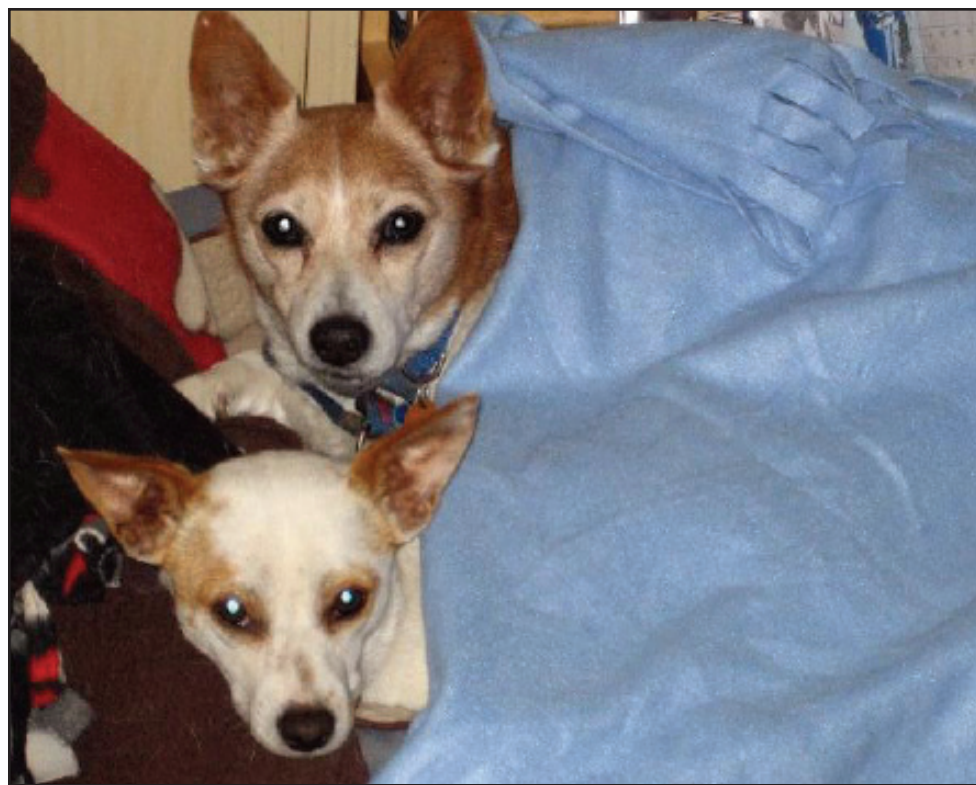
Sawyer living it up in Manhattan Beach.