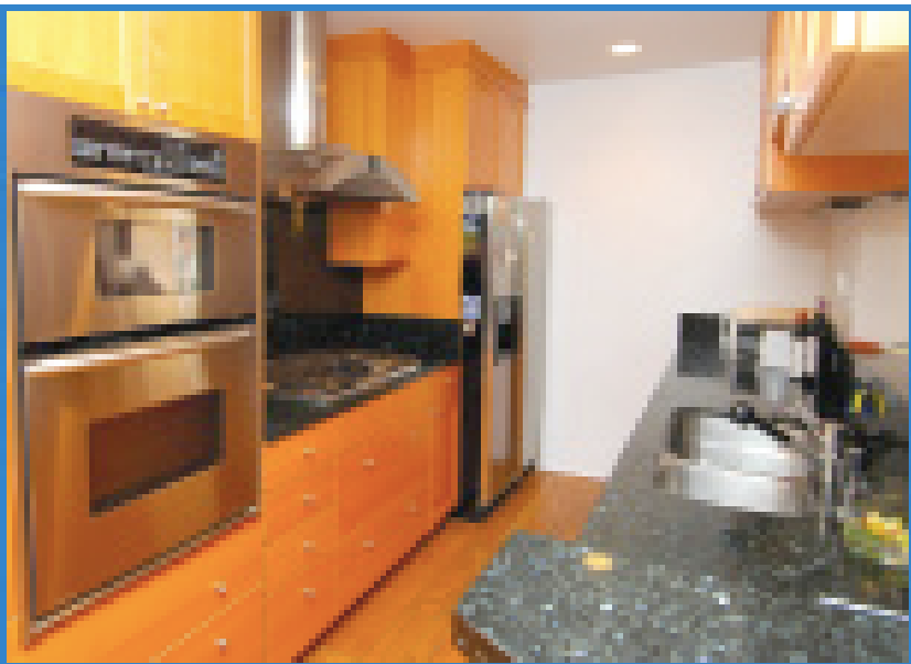
209 16th Street • Manhattan Beach Offered at: $2,699,000