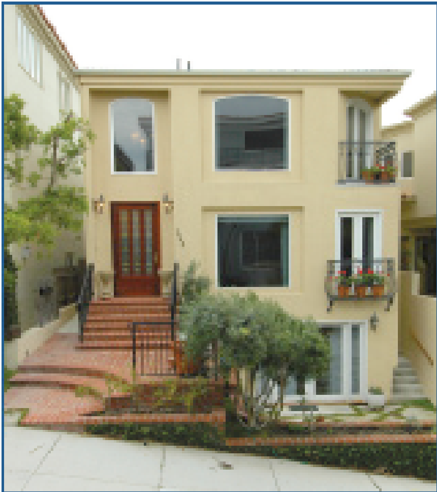
228 16th St., Manhattan Beach $2,950,000