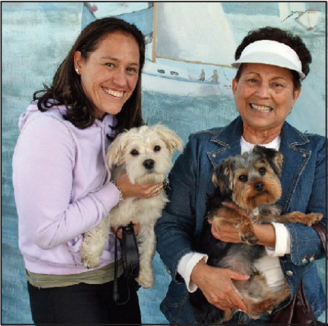
Cody (right) with his new family.

Our many thanks to the El Segundo Herald newspaper. Because of you, Cody found his forever home! Thank you Herald Publications, you helped save another one. Cody's family and new brother Dublin sent us a note about Cody's new life with them: