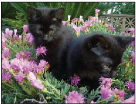
Midnight and Shadow