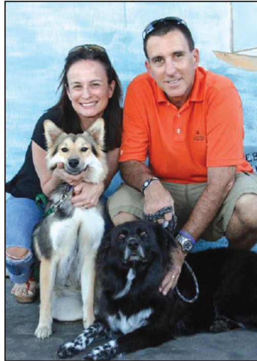
Roxy (left) found her forever home.

Last, but not least, Roxy was our final dog to be adopted from the Manhattan Beach Hometown Fair. From being abandoned in an Arizona river to a wonderful home in the South Bay, here is her update.