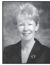
DRE # 00891136

Call an Independent Broker for all your Real Estate Needs!