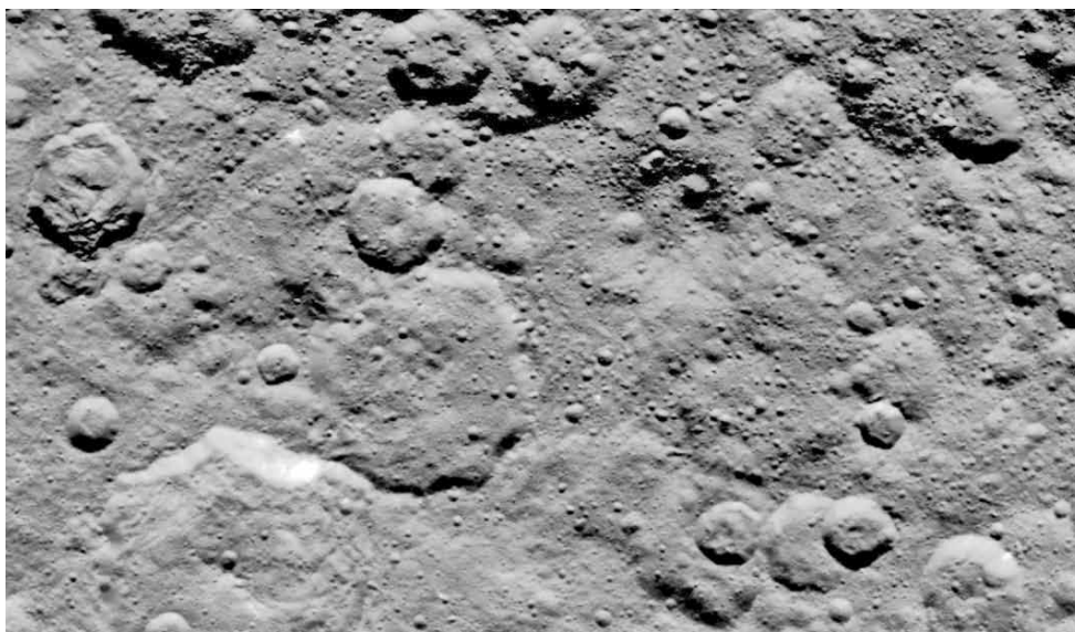
NASA's Dawn spacecraft photographed these craters in the northern hemisphere of Ceres, at resolution 1,400 feet per pixel, as it orbited the dwarf planet at 2,700 miles' altitude.

Numerous other features on Ceres intrigue scientists, as they contrast this world with