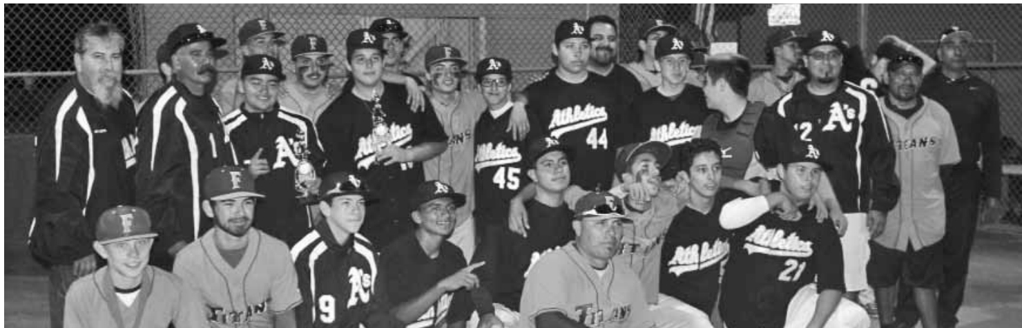
The Carl Magee, Jr. Senior Little League Baseball Tournament of Champions champion Lennox Athletics and runner-up Lennox Titans pose together after the A's downed the Titans 10-4 for the title Saturday at Jim Thorpe Park in Hawthorne.