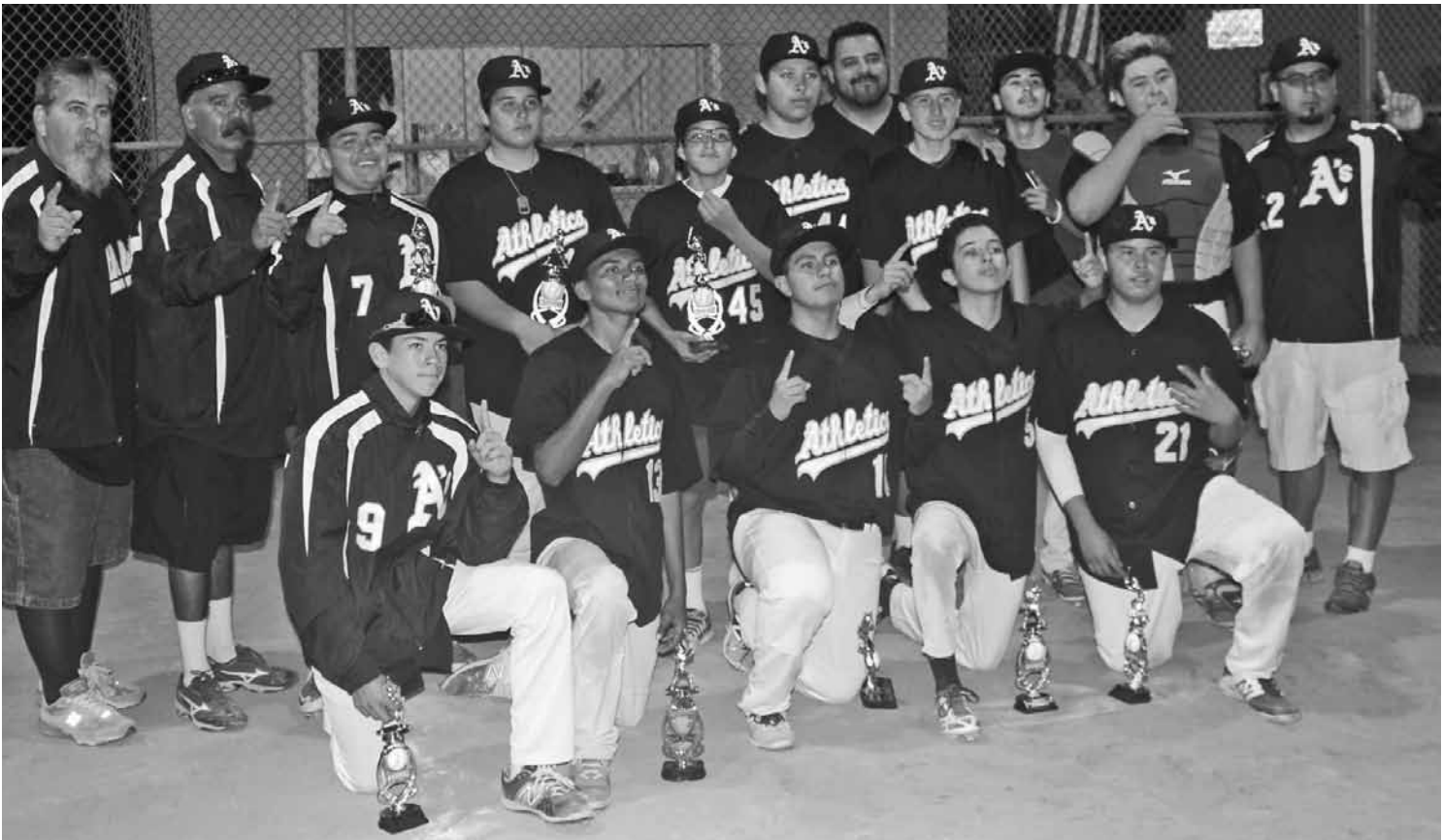
The Lennox Athletics won the Carl Magee, Jr. Memorial District 37 Senior Little League Baseball Tournament of Champions with a 10-4 win over their rival Titans Saturday at Jim Thorpe Park in Hawthorne.