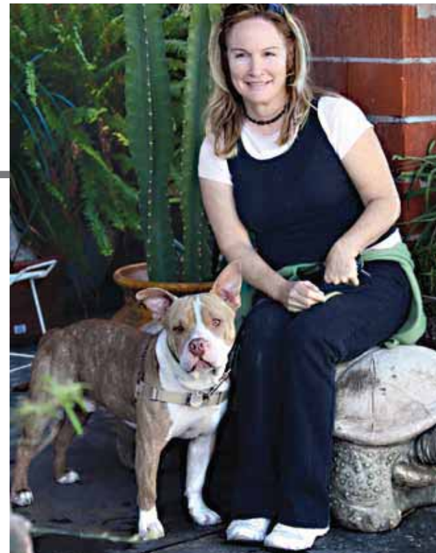
Ruckus, happy forever.

When you adopt a “pet without a partner,” you will forever make a difference in their life and they are sure to make a difference in yours. •