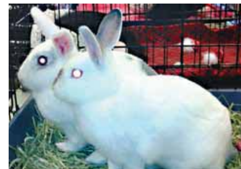
Daisy and her sister Lily

information and to see our other kitties, please check our website at www.kittenrescue.org , or email us at mail@kittenrescue.org . Your tax-deductible donations for the rescue and