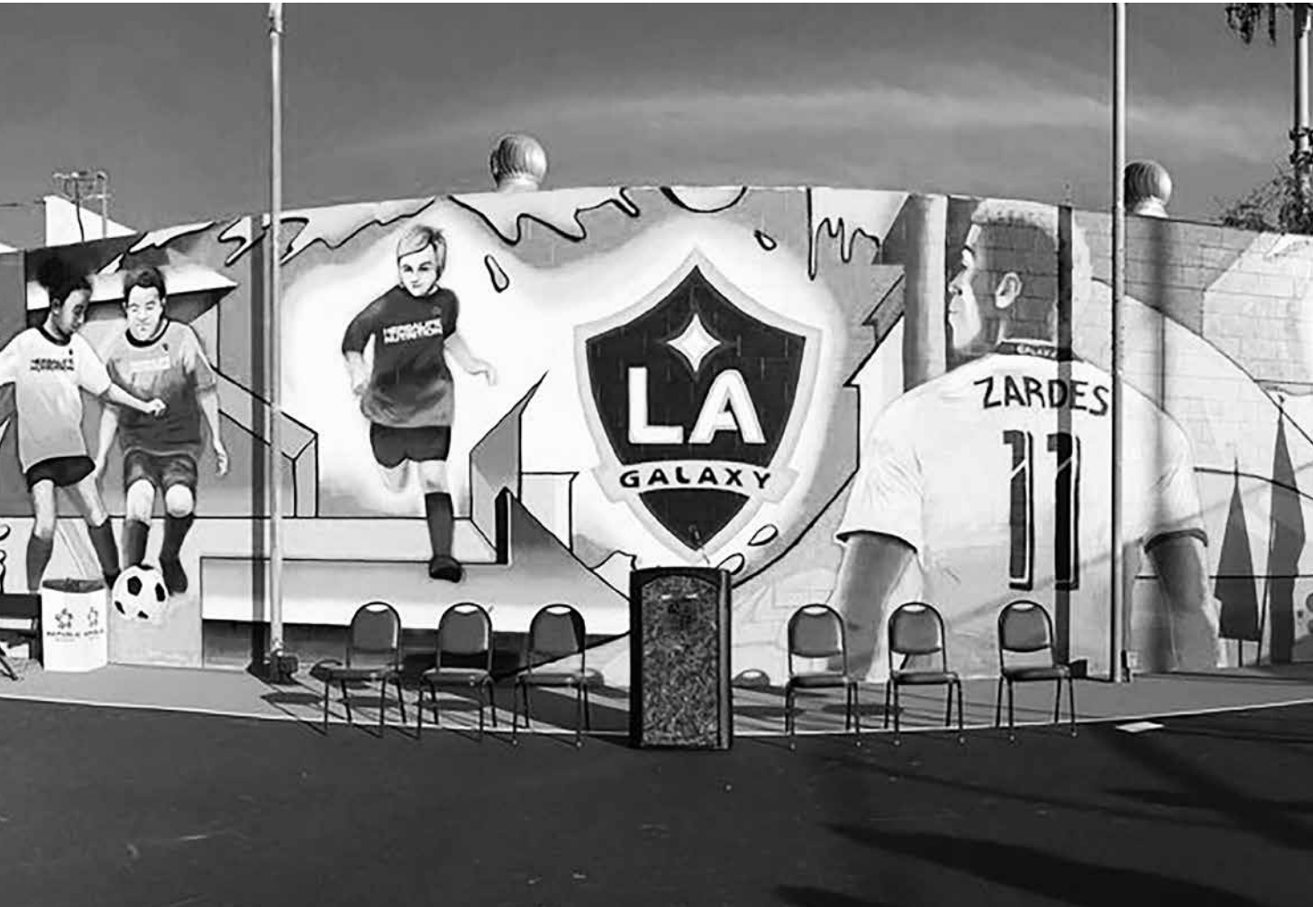
The start of the Major League Soccer season is just a few weeks away and Hawthorne’s Jim Thorpe Park recently achieved an important goal of its own when it unveiled two new small-sided soccer courts – thanks to the generosity of the LA Galaxy Foundation and Herbalife.