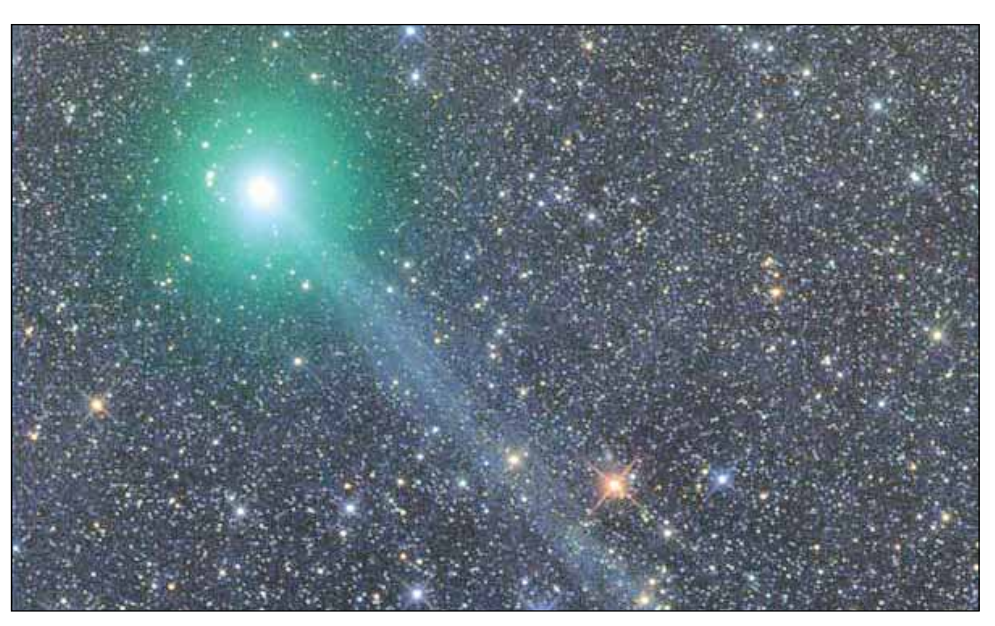
The new Comet Lovejoy, C/2014 Q2, as imaged on November 27th by Gerald Rhemann in Austria using a remotely operated 12-inch f/3.6 astrograph in Namibia.

To the unaided eye, Comet Lovejoy might be dimly visible as a tiny circular smudge under dark-sky conditions. Through binoculars