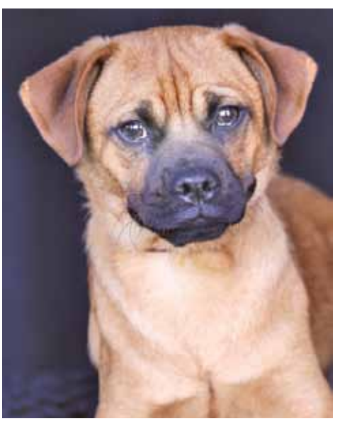
Gracie is a growing girl who loves to play, play, play.

To learn more about these and other wonderful dogs, visit our website at www. animalsrule.org. If a dog is on our website, it's available. Come to our Saturday adoption events from 11 a.m. -3 p.m. at 305 North Harbor Blvd., San Pedro (just off the 110 near the cruise port). We are always in need of donations for veterinarian bills and our senior dogs. Donations can be made through our website or by sending a check payable to: Animals Rule Placement Foundation at 305 North Harbor Blvd., San Pedro, CA 90731. All donations are tax-deductible; we are a registered 501@3 non-profit organization.