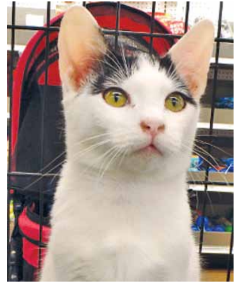
Micha is very adventurous and loves to explore.

Isabella is a very affectionate and devoted companion. Looking for your purr-fect match? Kitties of every color and size waiting to meet you. Isabella is super affectionate, a total lap cat and loves belly rubs. Her big blue eyes will melt your heart and you will have a devoted companion who gives as much love as she gets. Her scoliosis makes her back a little crocked and has given her a spiral tail,