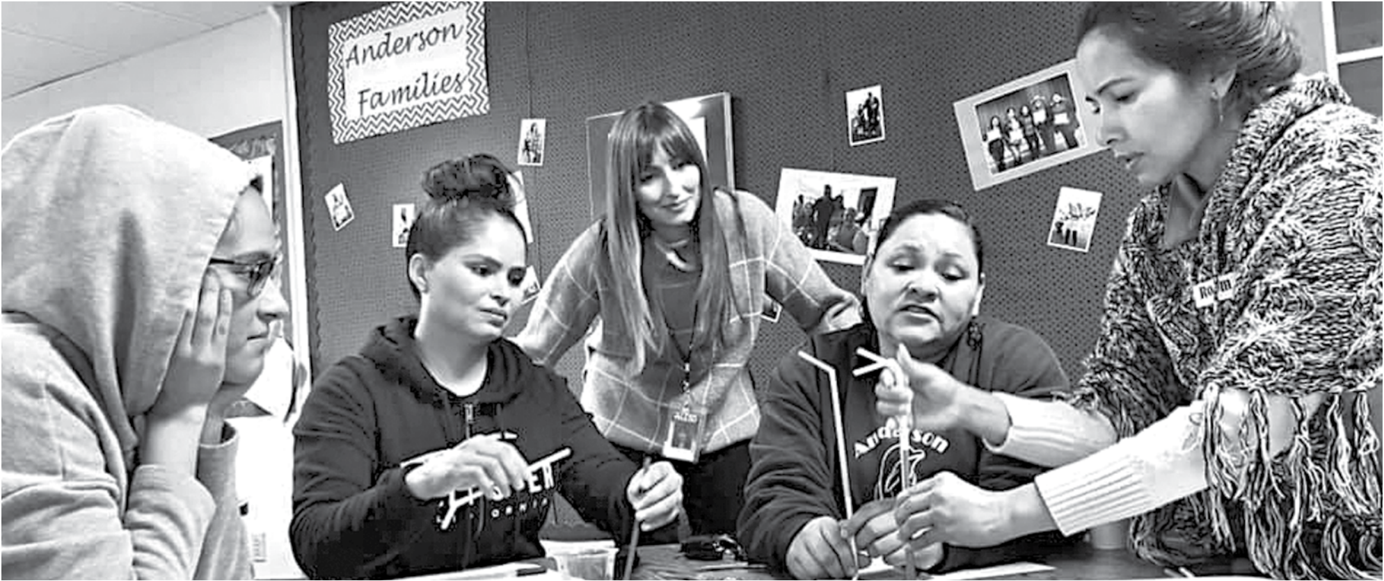
Anderson Elementary School in Lawndale really hit their stride during last week’s STEM Parent Workshop.