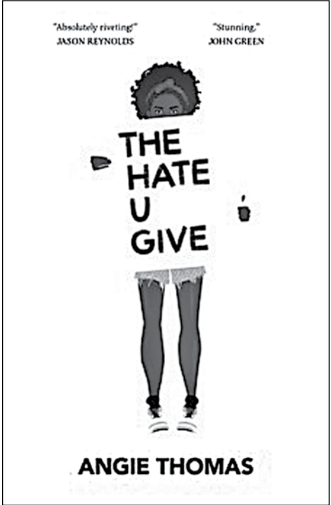
The Hate U Give by Angie Thomas.

Angie Thomas' New York Times best-selling young adult novel The Hate U Give won honors for both the Coretta Scott King and Michael L. Printz awards in 2018. It's an explicit political read that advocates for many different subjects and characters faced with emotional and complex situations. This novel was inspired