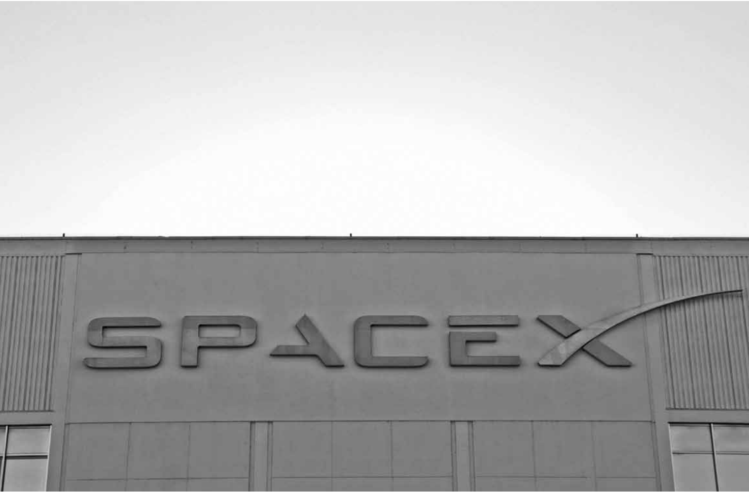
Our photographer’s view of the SpaceX building on Rocket Road, near Hawthorne Municipal Airport. On January 10, SpaceX launched its fifth successful commercial resupply services mission to NASA’s International Space Station.