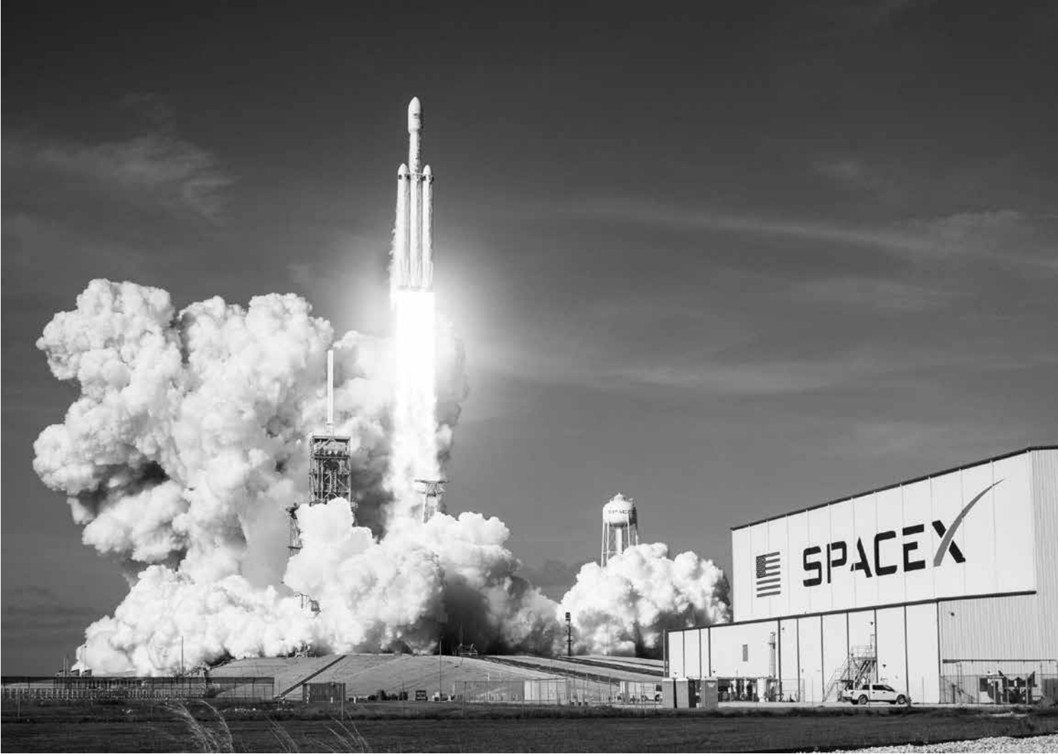
On Feb. 6, the Hawthorne-based SpaceX celebrated another successful launch with its Falcon Heavy rocket lift-off from the Kennedy Space Center in Cape Canaveral.