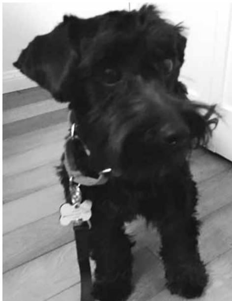
being the best companion ever. I'm super sweet and not very big, only 16 pounds, so I can easily accompany you wherever life takes us. If you are interested in Tracey, please email info@msfr.org for more information.

My name is Tracey and I'm on a quest. I'm looking for a very special treasure. A forever home with a doggie pal would be my idea of a crown jewel! If not a doggie pal, then I'd love a household where someone is home most of the time to keep me company. I don't like being alone and want a pal to share in my adventures. I'm a 6-year old, male, purebred Miniature Schnauzer with a twinkle in my eye and lots of affection to give my new family. When I was rescued from a Inland Empire shelter I had a huge tumor on my back that has been removed. I'm completely healed and looking forward to begin the journey of loving my people and