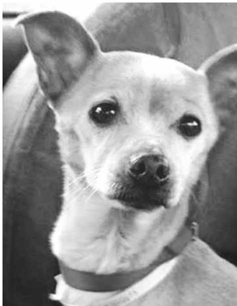
months I was beginning to wonder if I had worn out my welcome. Since, space is at a premium, a lengthy stay is very unusual and most dogs are euthanized. My rescuers think I must have been a shelter favorite because I was a resident for quite some time. I hate to brag but I think it's because I'm such a great guy! I ride well in a car; walk nicely on a leash; I'm quiet and very sweet with strangers. I'm pretty serious by nature and not really interested in playing with other dogs. I do, however, have impeccable manners so I'm calm around both large and small dogs. I must confess that for a mature gentleman, I'm in good health and at my perfect weight of 12 pounds so do I fit the bill for your perfect companion? I believe that an apartment dweller that would appreciate the socially acceptable behavior of a reserved fellow would bring the joy and happiness to my life. Guiseppa can be seen anytime at Yellow Brick Road Doggie Playcare in El Segundo. Call 310-606-5507 or email southbaydoggie@hotmail.com for an appointment or additional information. •

I'm Guiseppe , a 10-year old, male Chihuahua mix. The guess is, that due to my delicate frame and long legs, I could be a Chippet (Chihuahua/Whippet mix). After being at the Baldwin Park shelter for over 2