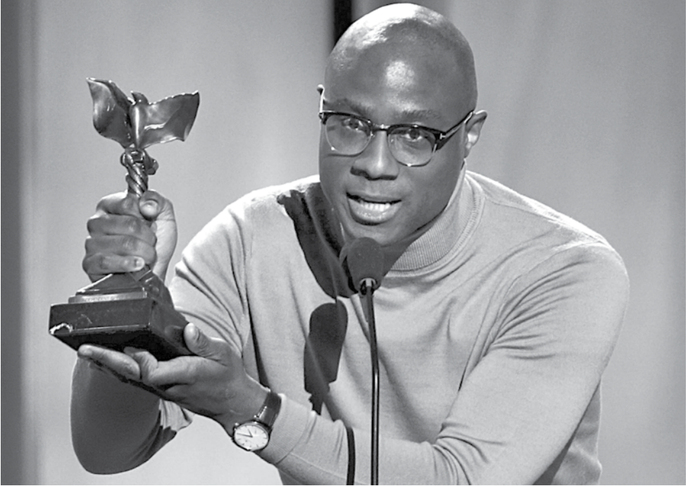
Barry Jenkins, winning the award for Best Director at the 34th annual Independent Spirit Awards.

Other notable awards went to Can You Ever Forgive Me? ’s Nicole Holofcener for Best Screenplay, Eighth Grade ’s Bo Burnham for Best First Screenplay, and Sorry