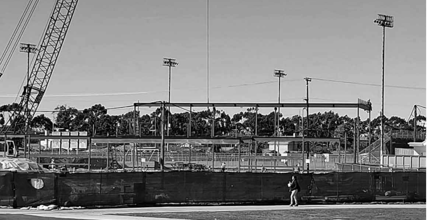
Hawthorne High School’s newest building has begun to appear over the construction fence line. This building will house performing arts classes and the NJROTC. Code Name: The Noise Building. It will be an exciting, creative space!