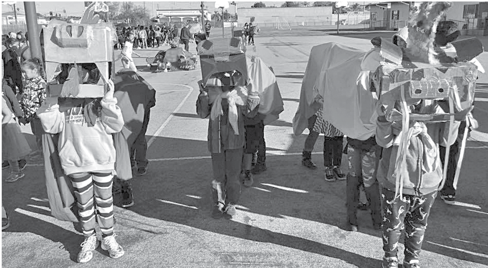
Students at Billy Mitchell Elementary collaborated with students from Jane Addams Middle School to create over 40 life-size dragon heads in celebration of Chinese New Year.