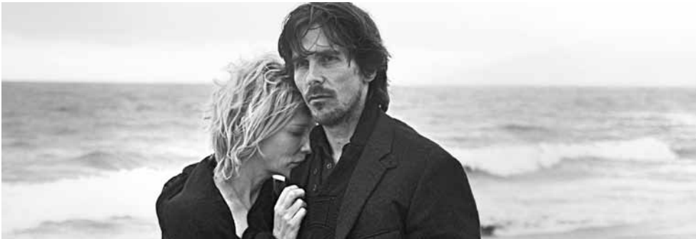
Cate Blanchett and Christian Bale in Knight of Cups.

Christian Bale goes from playing one Dark Knight to another, a dark knight of a man weighed down by his own brooding and self-imposed burdens as he meanders and moseys through what one would surmise to be a personal journey of self-discovery, in Terrence Malick's new film, Knight of Cups , opening limited in theaters today. Knight of Cups is truly arthouse cinema. This is not a commercial movie, which means there's a different sort of story unfurling here not typically seen or expected in mainstream movie-going – which, full disclosure, is also to say that there's barely a whiff of a story here at all, and is rather