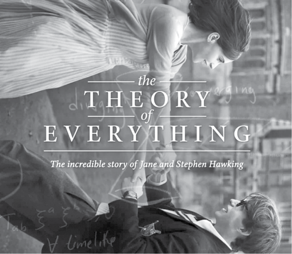
The Theory of Everything.

(Redmayne would go on to win the Academy Award for Best Actor). Redmayne captures this challenging period in time with real bravado: he finds the humor in the grim, the joy in the sadness, and the brilliance in the silence. Not to be outdone is Felicity Jones, who grounds the film with her selflessness and agitated, yet calm demeanor. Jane is a woman to be