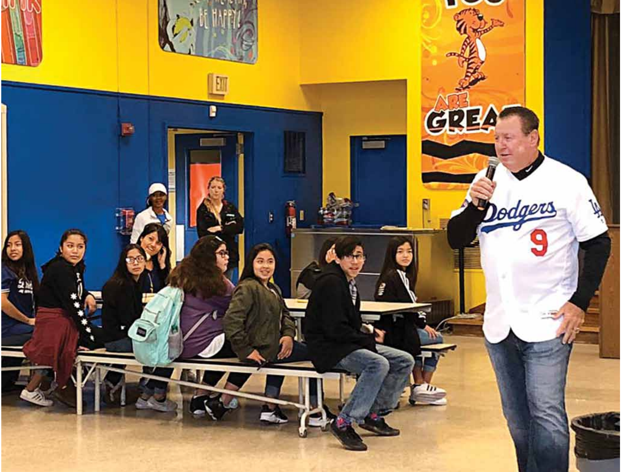
Former Dodger World Series hero Mickey Hatcher visited FDR Elementary on Super Saturday to encourage students on the importance of education, being kind and working hard to achieve your goals.