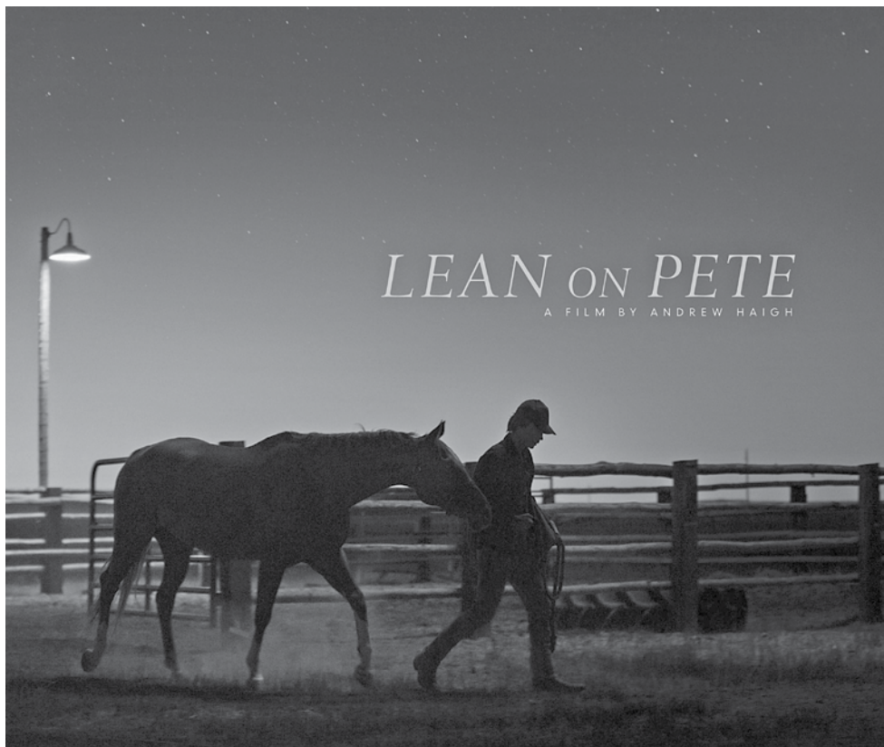
Lean on Pete.

Coming off of last year's role as the kidnapped J. Paul Getty III in All the Money in