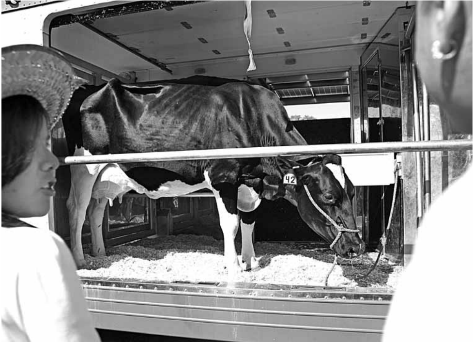
Felton Elementary School students got to meet a cow and calf up close last week, thanks to a special visit from the Dairy Council of California’s Mobile Dairy Classroom.