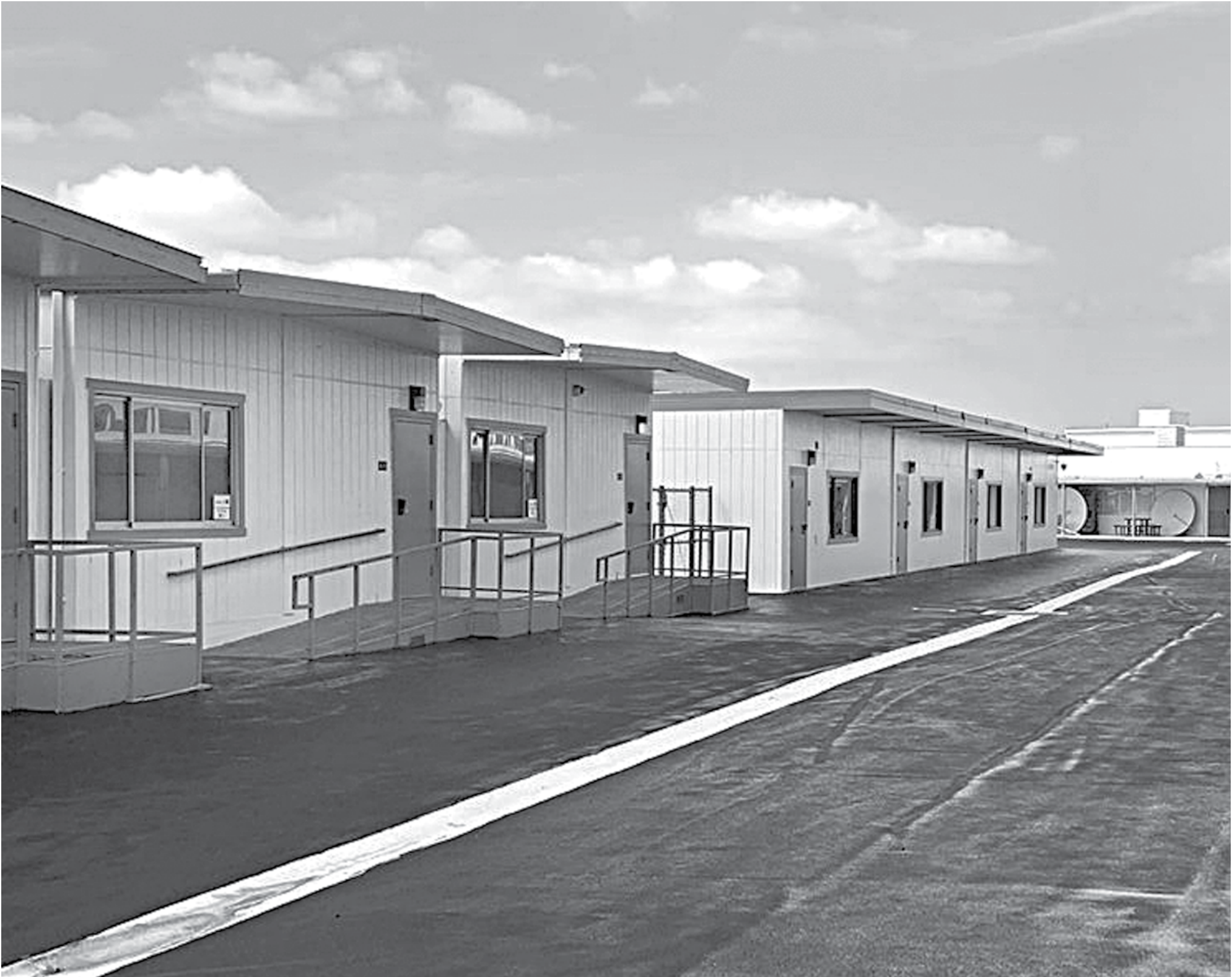
Lawndale Elementary School District campuses continue to see upgrades thanks to funds from the community-ratified Measure L. This photo shows the new pavement at Will Rogers Middle School where crews worked during the recent spring break.