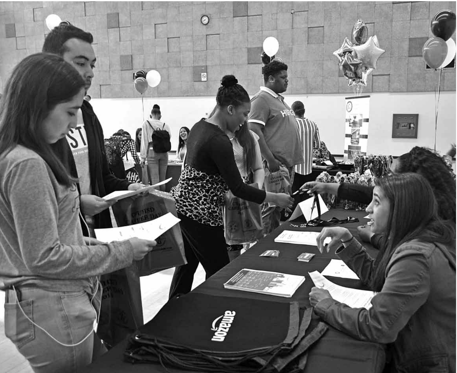
Centinela Valley Union High School District students visit with representatives from Amazon to learn about career opportunities and required qualifications to gain employment during the second annual Career Fair presented by CVUHSD in cooperation with the South Bay Workforce Investment Board at the Hawthorne Memorial Center.