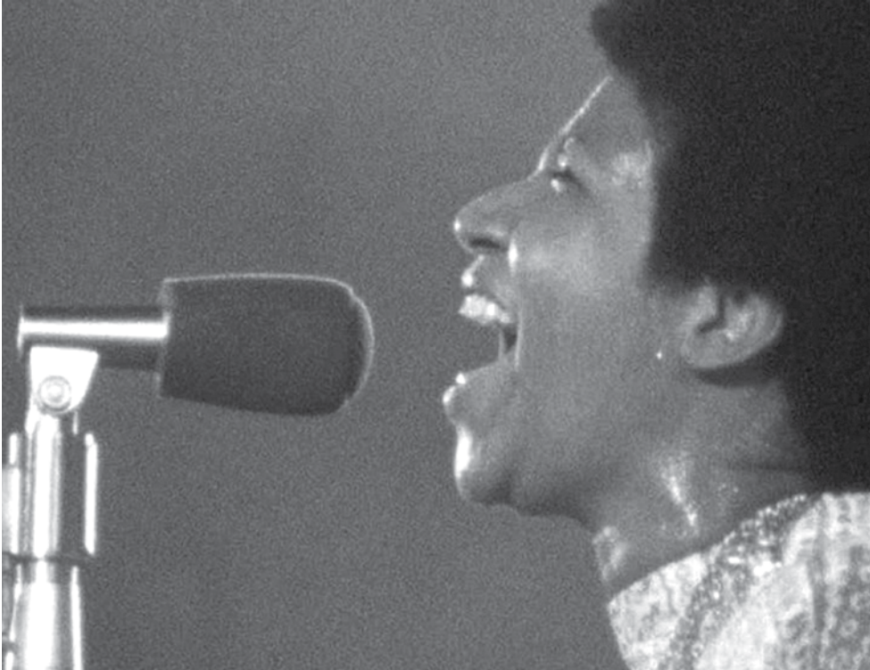
Amazing Grace