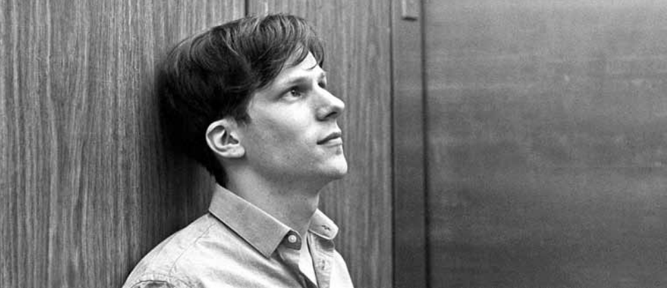
Jesse Eisenberg in Louder Than Bombs .

What sets Louder Than Bombs apart from other films of recent memory are the surreal moments Trier infuses within the story. Disregarding the traditional method of linear storytelling by shifting between the past and