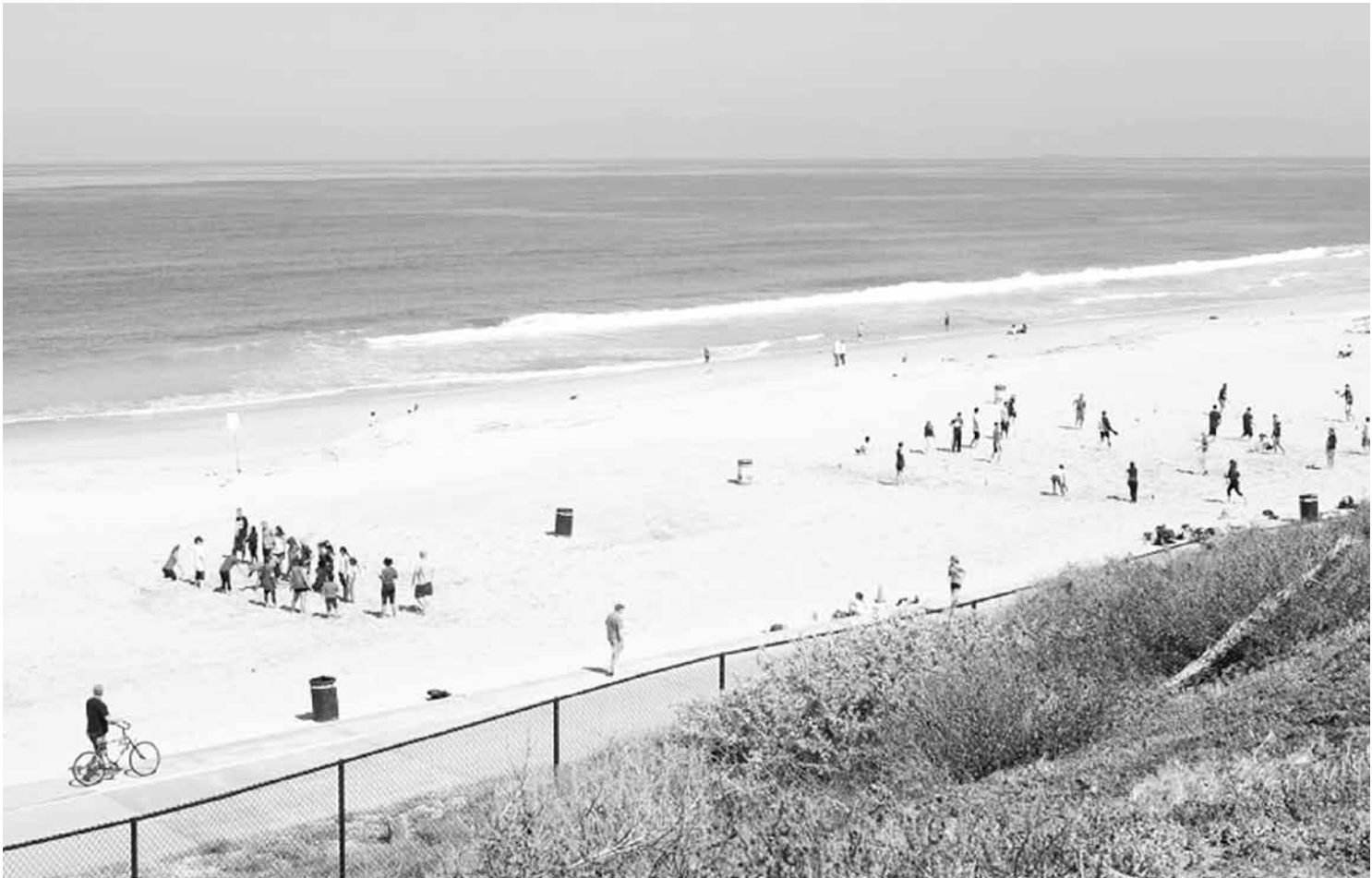
Boot Camps, bicyclist and runners enjoy the sunshine. Exercise doesn't hurt as much, if you do it at the beach.