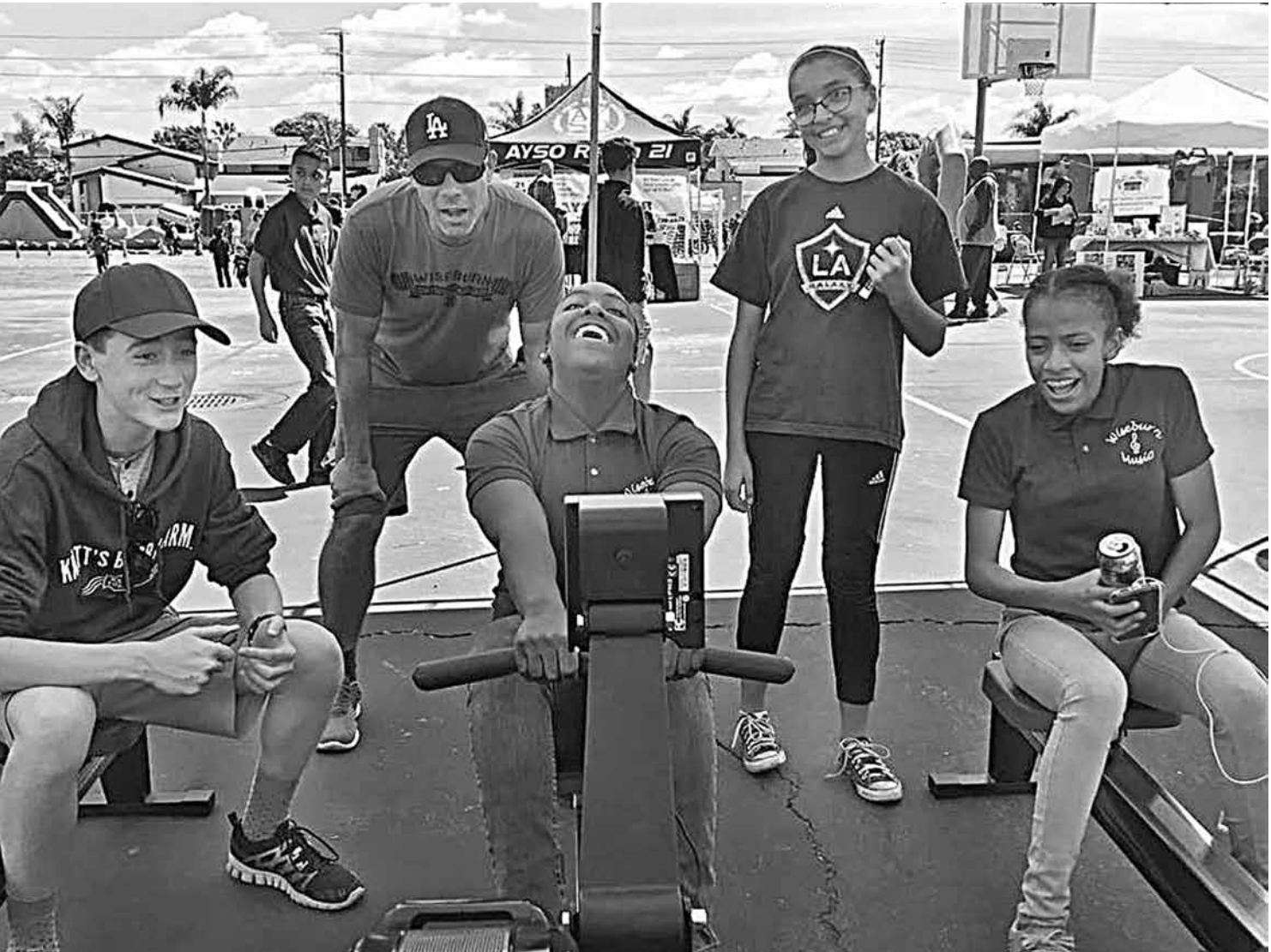
Here's a shout out to all the awesome Dana Dolphins who rowed their hearts out at Rock Around the Block and were rocking the obstacle course in P.E. last week!