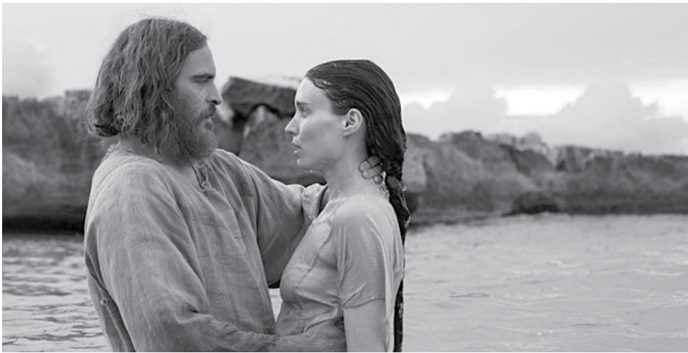
Mary Magdalene