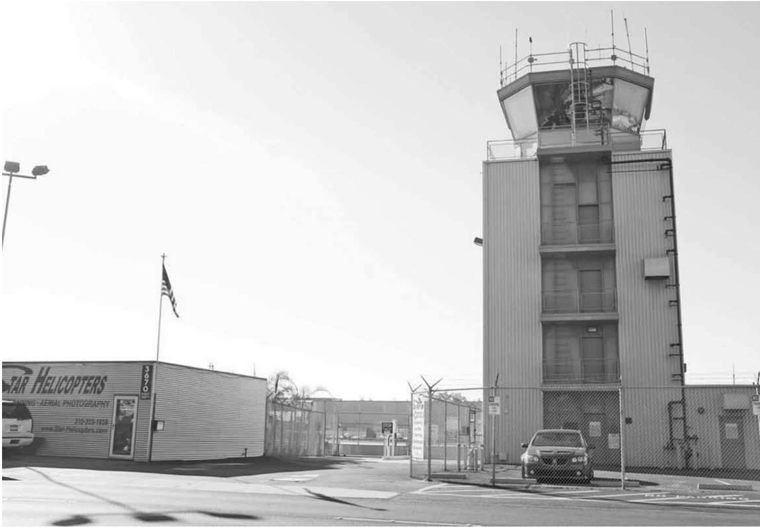
A view of Hawthorne airport and Star Helicopter, which gives aerial tours of Los Angeles. On April 14, the city council discussed a proposed property grading and building license near the airport runway.