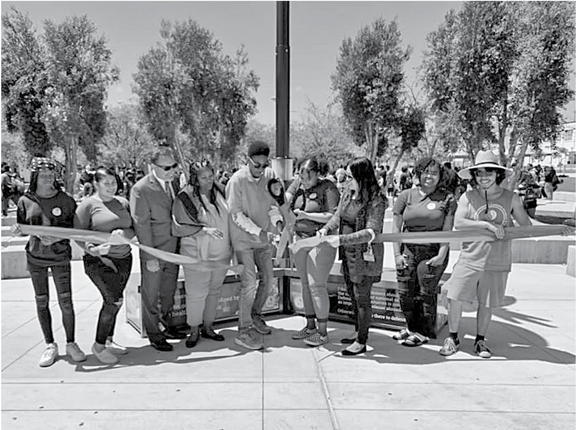
Leuzinger High School held its first annual Earth Day celebration, including a ribbon cutting for the new wind turbine/solar panel that provides a station for students to charge their Chromebooks and sends data to Environmental Careers Academy students.