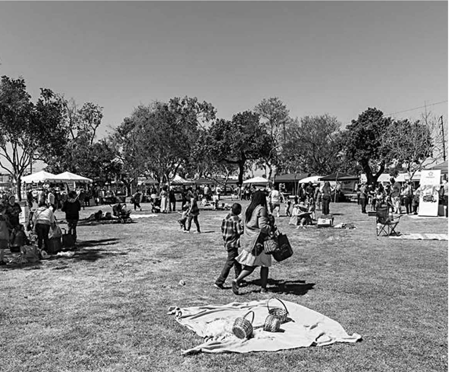
The Hawthorne Community Earth Day Festival was held on April 13, at the Hawthorne Memorial Center. The festival was produced by the City of Hawthorne Public Works Department in cooperation with the Hawthorne\AXLennox Rotary Club. Various vendor booths provided information on how to preserve and protect our natural resources while reducing energy consumption.