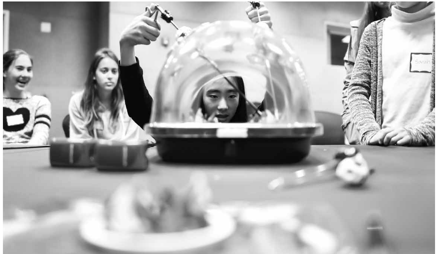
Palos Verdes Intermediate School STEM (science, technology, engineering and technology) students learned about laparoscopic and robotic surgery while participating in simulation exercises during a recent field trip to Torrance Memorial Medical Center. Laparoscopic surgery technique pictured above.