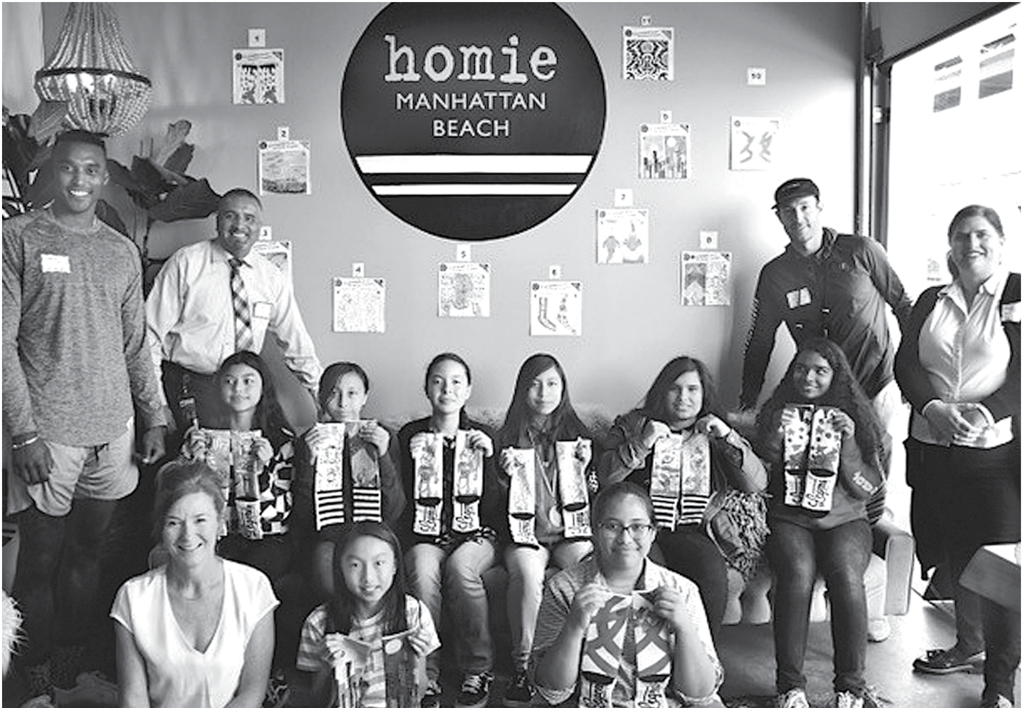
Congratulations to students from Jane Addams Middle School and Will Rogers Middle School for being finalists in last week’s “Socks that Rock” contest! Eight Lawndale Elementary School District students were honored with a sock in their design at the Homie Café in Manhattan Beach.