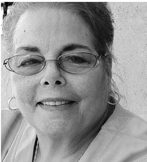
Mom you will always be in my heart. Thank-you for always Loving me. Dad and I love you so very much. Your Loving Daughter.