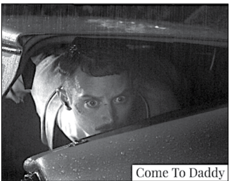
Come to Daddy

The funniest and wildest movie we saw at