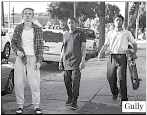
Gully