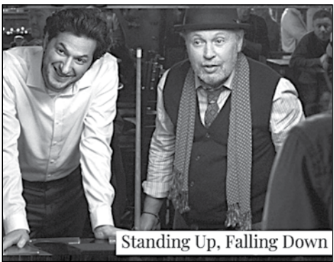
Standing Up, Falling Down

comedian Scott (Ben Schwartz) leaves L.A. to move back in with his parents in Eastern Long Island. At 34, it hits on a certain anxiety of this millennial generation that feels honest. Now home, Scott is forced to confront the life he left behind for the dreams of L.A. – and the people he left, including sister