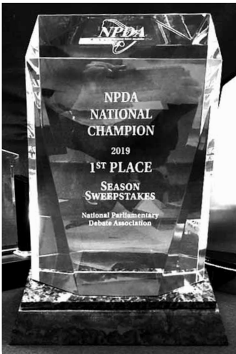
The forensic debate team at El Camino won three collegiate national championships this season.

A background in communications studies at El Camino is a solid beginning to a rewarding career, according to the department. "Students who learn to communicate ideas in a way that promotes understanding with