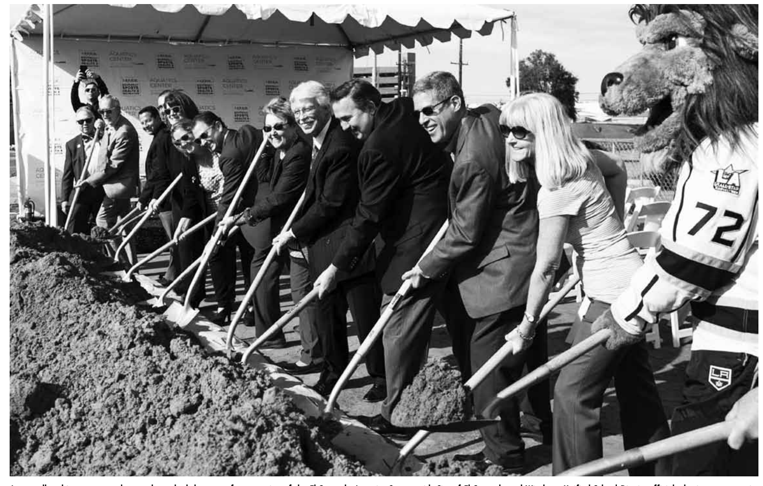
A groundbreaking ceremony last week marked the start of construction of the El Segundo Aquatics Center--with City of El Segundo and Wiseburn Unified School District officials, business community supporters and LA Kings mascot Bailey on-hand wielding shovels.