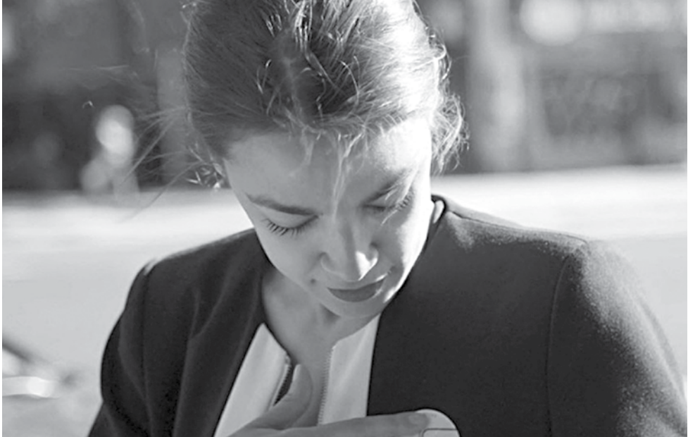
Knock Down the House