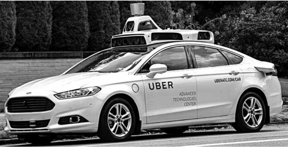
Drivers want more job protection and pay, but Uber wants to go in another direction.

companies to operate self-driving cars and SUVs on public streets. Google auto-piloted cars are regular sights in the Bay Area. A