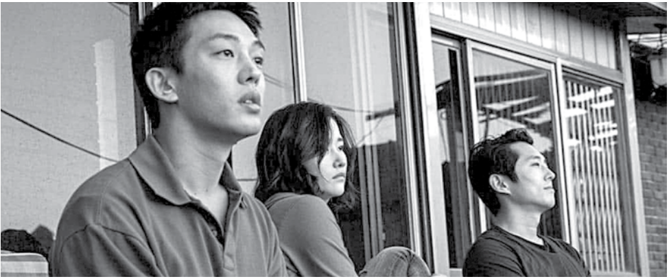
Burning

calls Ben a Korean Gatsby, ranting, "How does he live like this at his age? Traveling abroad, driving a Porsche, listening to music while cooking pasta." He seems to believe that Ben is everything insincere, while his own connection with Hae-mi is real. Jong-su claims he's an observer of life's mysteries rather than a judge, but we watch as his -- and our -- judgmental, pattern-seeking impulses flare at Ben's behavior. It's not long until Jong-su gets the