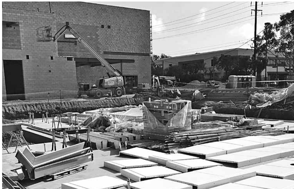
A smaller pool for warm-ups, teaching and fitness is next to the main pool.