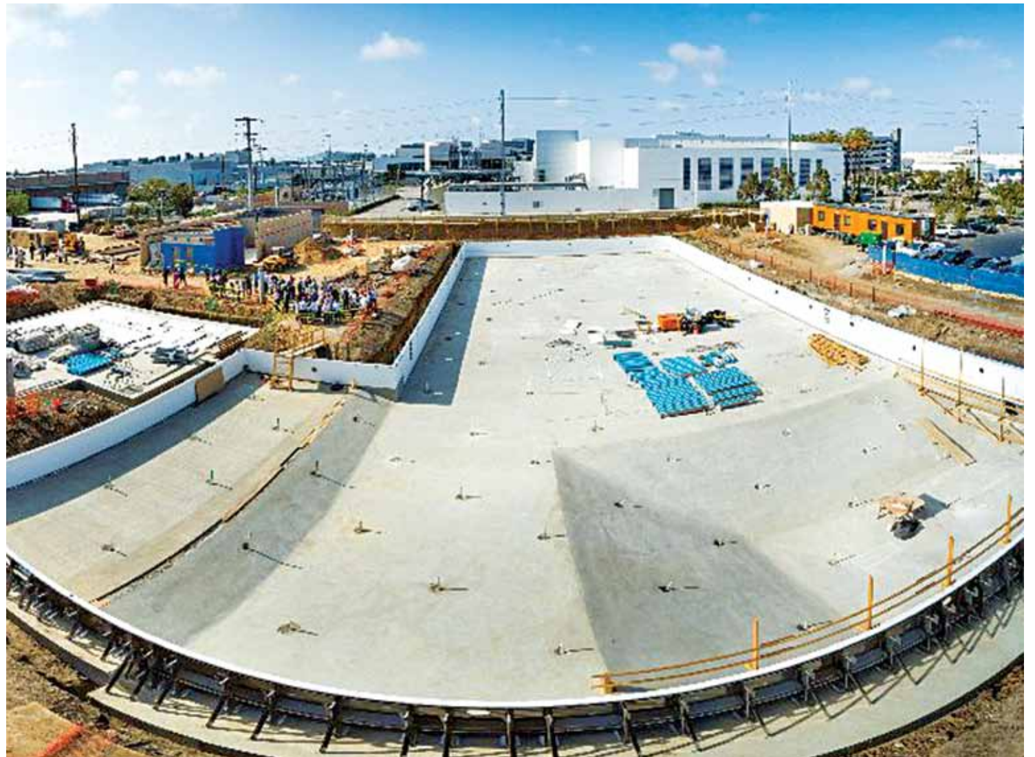
Construction of the El Segundo Aquatics Center at the Wiseburn High School site continues to progress and is on target for a September 2018 opening. Here is a recent shot of the pools in progress. For more photos see page 4.