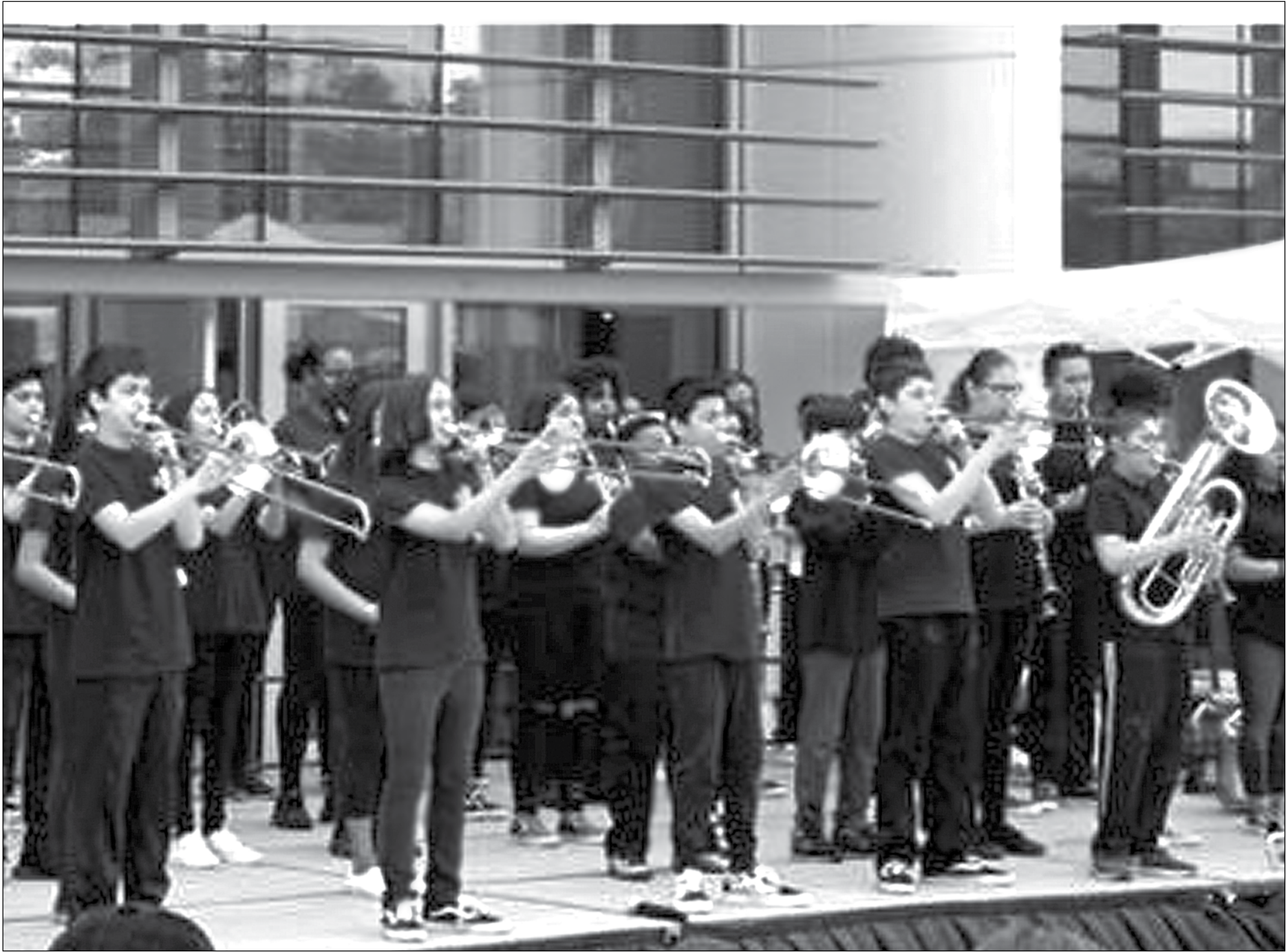
The Fabulous Bengal Band and Cheer from Jane Addams Middle School showcased their skills at the TakePART Arts Festival last weekend.

“Art and music education help children develop abstract thinking that helps them in the business world.”