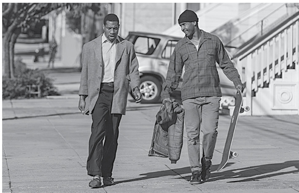
Jonathan Majors and Jimmie Fails in The Last Black Man in San Francisco.

time, and The Last Black Man in San Francisco suggests that the financial dissolution that led to selling the house was a precursor to a more general dissolution as Jimmie's family dispersed and their bonds weakened. So, Jimmie skateboards over with his friend Montgomery (Jonathan Majors) anytime he can – often getting found out by the white couple as he weeds their garden or spruces up their trim. It's a brisk, even funny introduction to a story with interests that naturally encom-