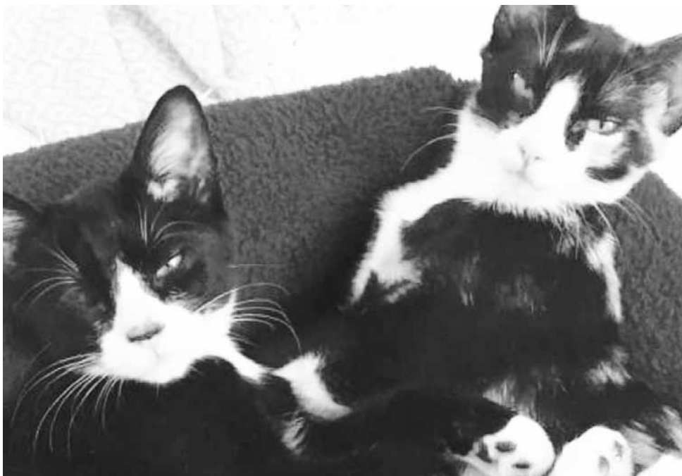
Callie and Dash

Conway (Connie) is a sweet, goofy and affectionate young cat. She is one of eight cats rescued in 2016 from the demolition site at the 6th Street Bridge living in very dangerous conditions. She is a rare ginger female like