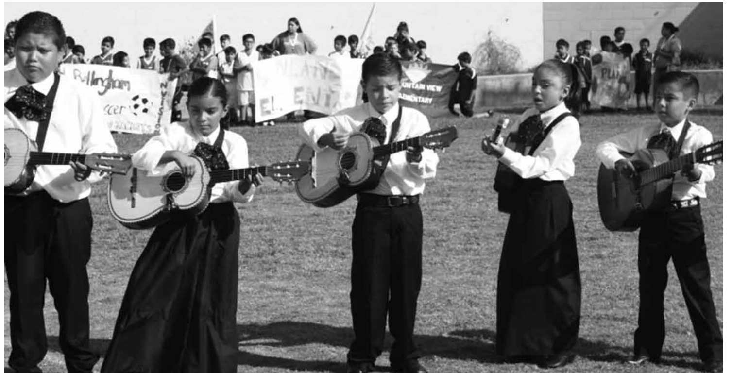
The Los Angeles County Arts Commission has awarded The Community Impact Arts Grant to Woodcraft Rangers. The grant will provide funding for Woodcraft's mariachi and folklorico programs and their performing arts competition, Spirit Jam. This grant will allow the 94-year-old organization to expand its already amazing mariachi and folklorico programs into other schools. Woodcraft Rangers is a nonprofit organization serving the youth and communities of Southern California.