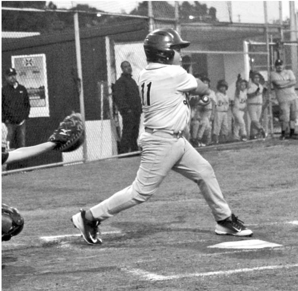
A Lennox Tiger batter takes a swing at a pitch during a Carl Magee District 37 Tournament of Champions game against the Westchester Yankees on Friday.