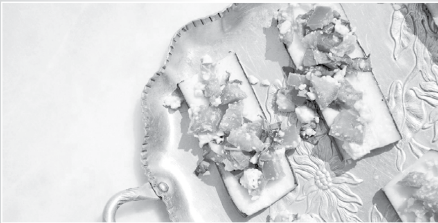
Makes 6-8 servings