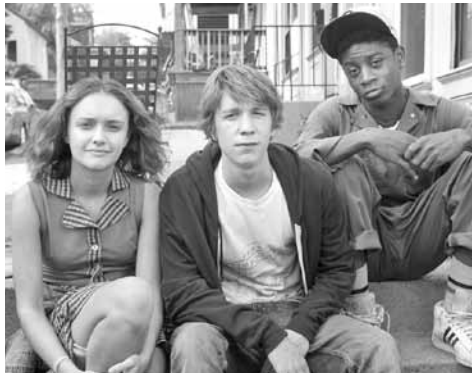
Olivia Cooke, Thomas Mann, and RJ Cyler in Me and Earl and the Dying Girl.

It's hard to deny the power of the two anchoring performances in Me and Earl and the Dying Girl —those of Thomas Mann, or Me, and Olivia Cooke, or the Dying Girl. Mann plays Greg, a reserved teenager whose high school life depends on a carefully cultivated neutrality and lack of involvement, soon threatened when his mother decides he should befriend an ailing classmate he barely knows. So we meet