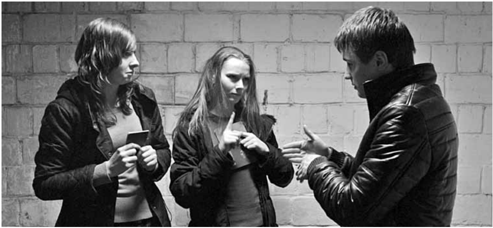
The Tribe.

I can’t think of the last movie I went to that left me physically uneasy, and I say that as a compliment. I felt cold sitting in the theatre, and I attribute that to the phenomenal