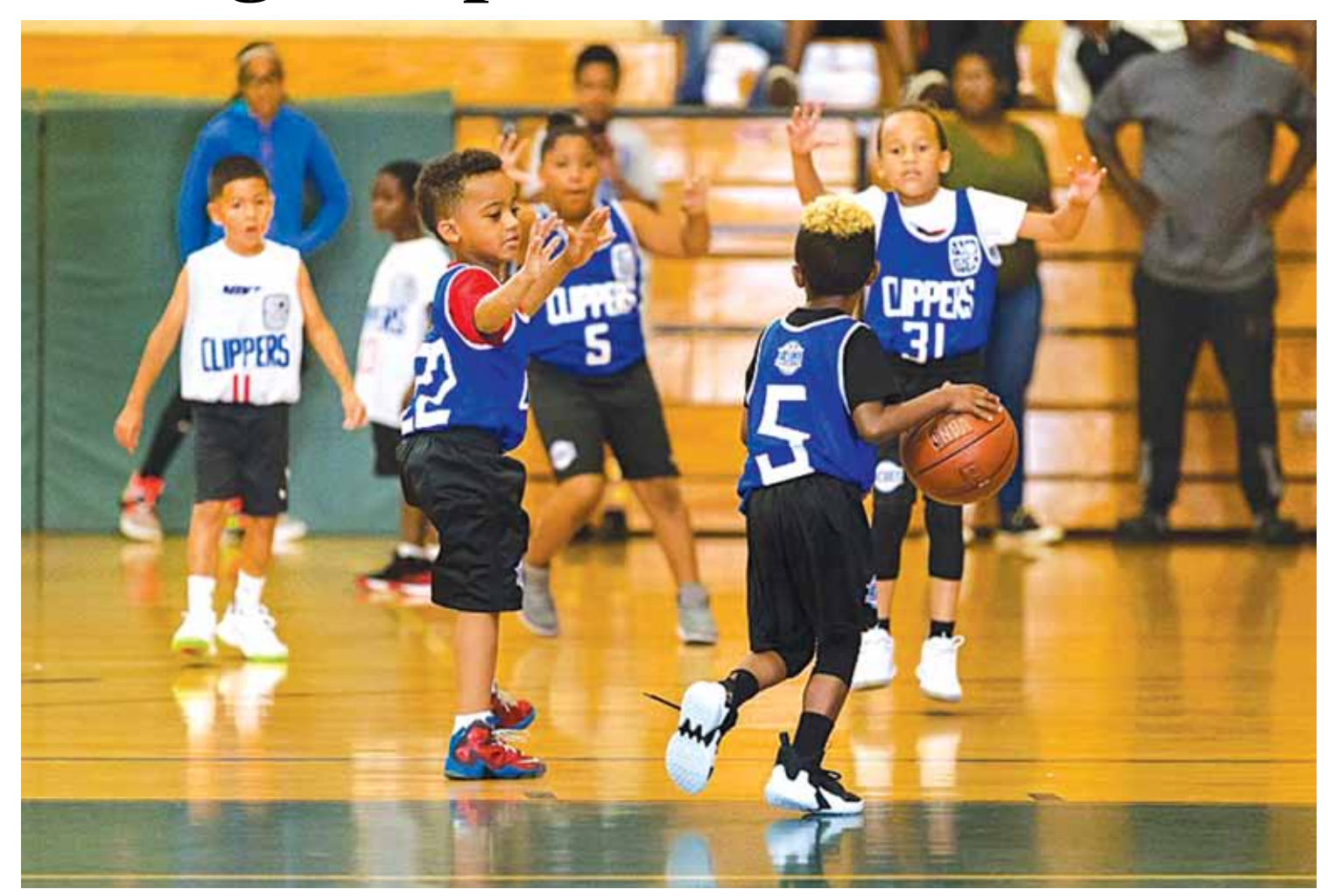
This past Saturday was opening day for team play for the City of Hawthorne's summer basketball program. Here, the young Clippers hope to swish a few shots while also learning the game