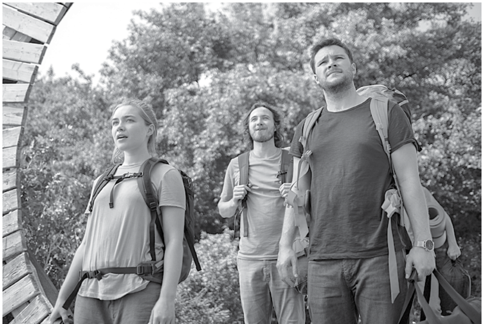
Midsommar

Pugh as the terror-induced Dani who carries the weight of the film, and whose bloodcurdling screams rival that of Toni Collette's in Aster's breakout directorial debut, Hereditary. Midsommar accomplishes great visual moments as well. The cinematography soars and glides so seamlessly that it feels like a VR experience, and psychedelic drug trips are so visceral that they feel like extended sequences of Gaspar Noé's recent horrorhallucination film, Climax.