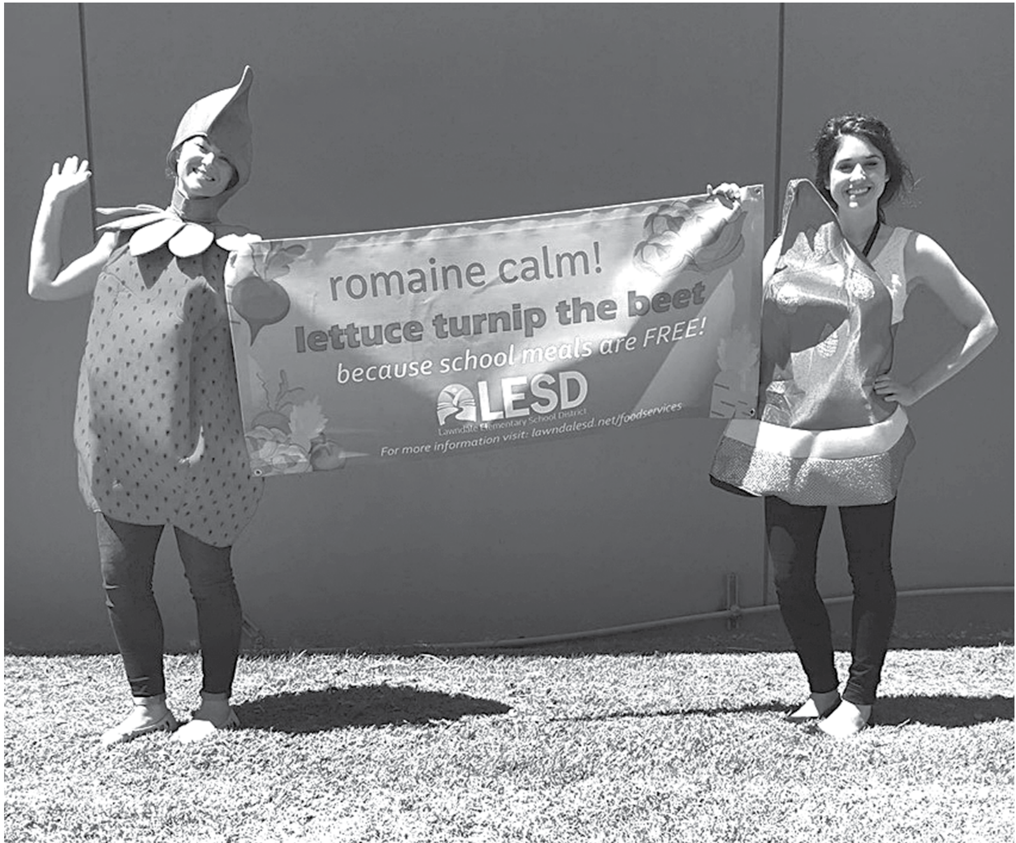
In case you missed it, the Lawndale Elementary School District is berry eggcited to share this not-so-new news. Lettuce rejoice that meals are at no cost. That's a huge dill...