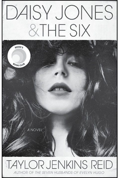
Daisy Jones & The Six by Taylor Jenkins Reid

For more information, please call (310) 412-6400 or visit www.asmdc.org/burke