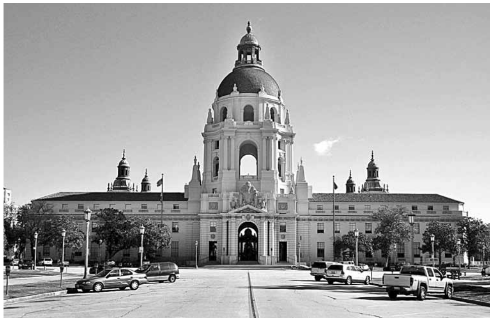
Pasadena City Hall.

COSPAR is celebrating its 60th anniversary this year. It was founded in 1958—the same year the U.S. launched the Explorer 1 [https://www.jpl.nasa.gov/missions/explorer-1] spacecraft, a research satellite built and operated by JPL. •