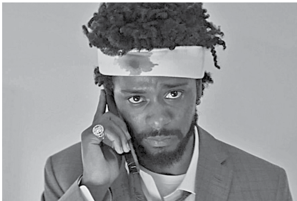
Sorry to Bother You