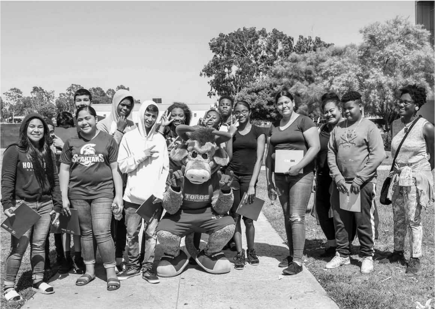
A group of students from the Hawthorne as well as Inglewood Unified and Torrance Unified school districts participated in the sixth annual “A Day in the Life of a College Student” at California State University, Dominguez Hills that included a campus tour, workshops and overnight stay from July 9-10. The ongoing event is part of the South Bay Promise program made possible through partnerships of the Hawthorne and Inglewood Teen Centers, South Bay Workforce Investment Board and CSUDH.