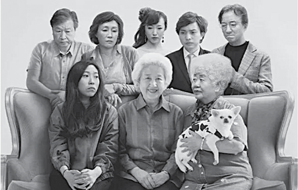
The Farewell, Courtesy of A24

Combining the best of Awkwafina’s slouchy,