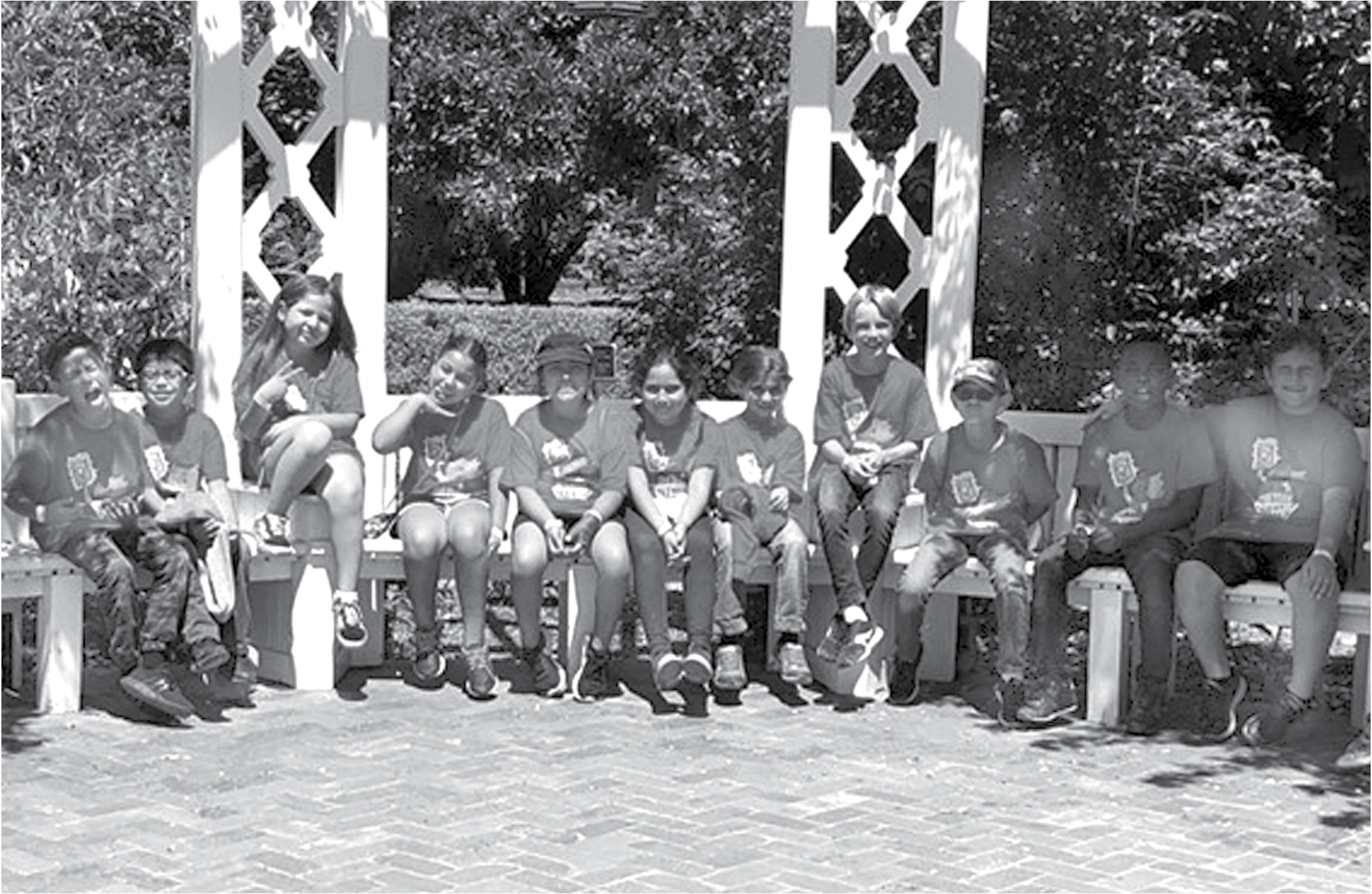
The last few weeks have been busy but full of fun for Lawndale Elementary School District kids! Students in RAP Summer Camp were able to attend the Arboretum, LA Library, Beach, The Getty, Natural History Museum, Jamba Juice, 7-Eleven and watch Toy Story 4 or Spider-Man.

“Summer camp was a place where I felt like myself that wasn’t like school. There were no grades, we got to try lots of new things, and I started to play guitar at camp. It was a place for acceptance and learning to be a part of a community, but also learning to be yourself. I want that for all kids.”