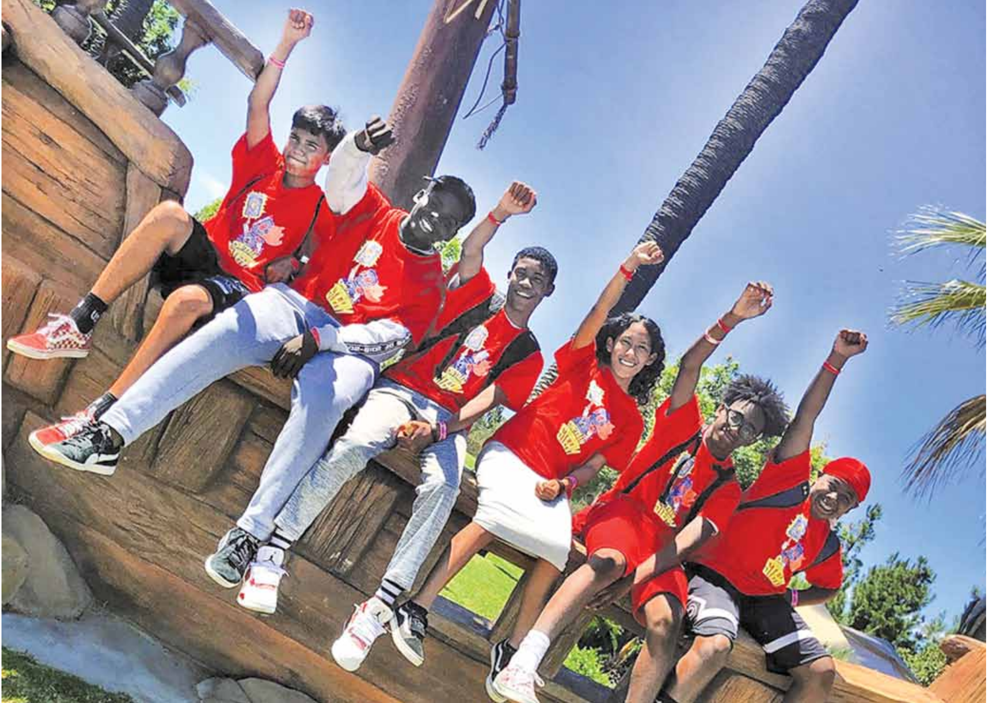
Lawndale Elementary School District superheroes unite at the RAP (Realizing Amazing Potential) Marvel Mania Summer Camp.

"I think a hero is an ordinary individual who finds strength to persevere and endure in spite of overwhelming obstacles."