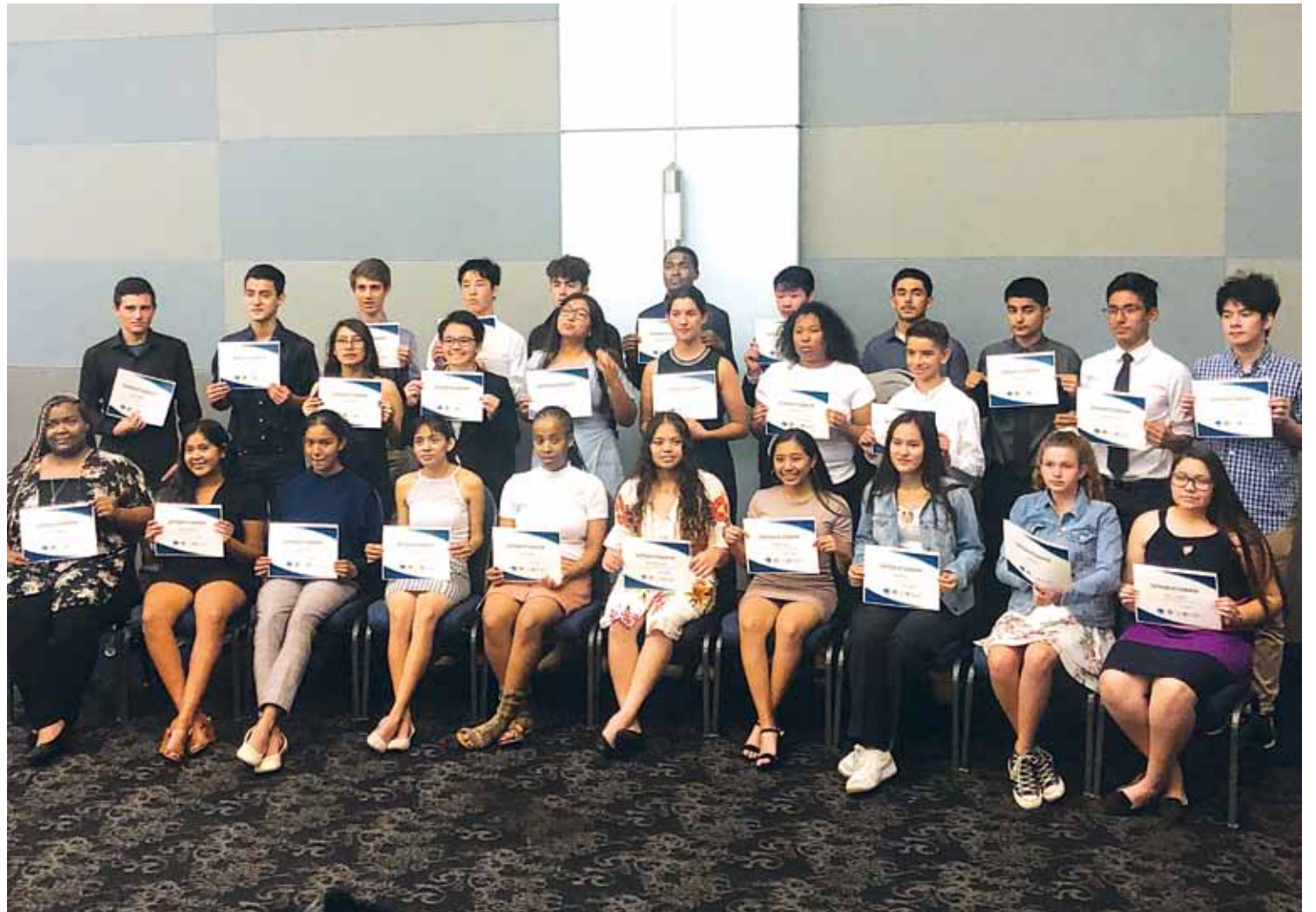
Selected middle and high school students from the Inglewood Unified School District and Centinela Valley Union High School District partook in a two-week program with the National Summer Transportation Institute (NSTI), offered by the College of Engineering, Computer Science, and Technology at Cal State LA from June 27 through July 15. The students flew airplanes after learning about the transportation industry. The program concluded with a graduation dinner Monday, July 15.