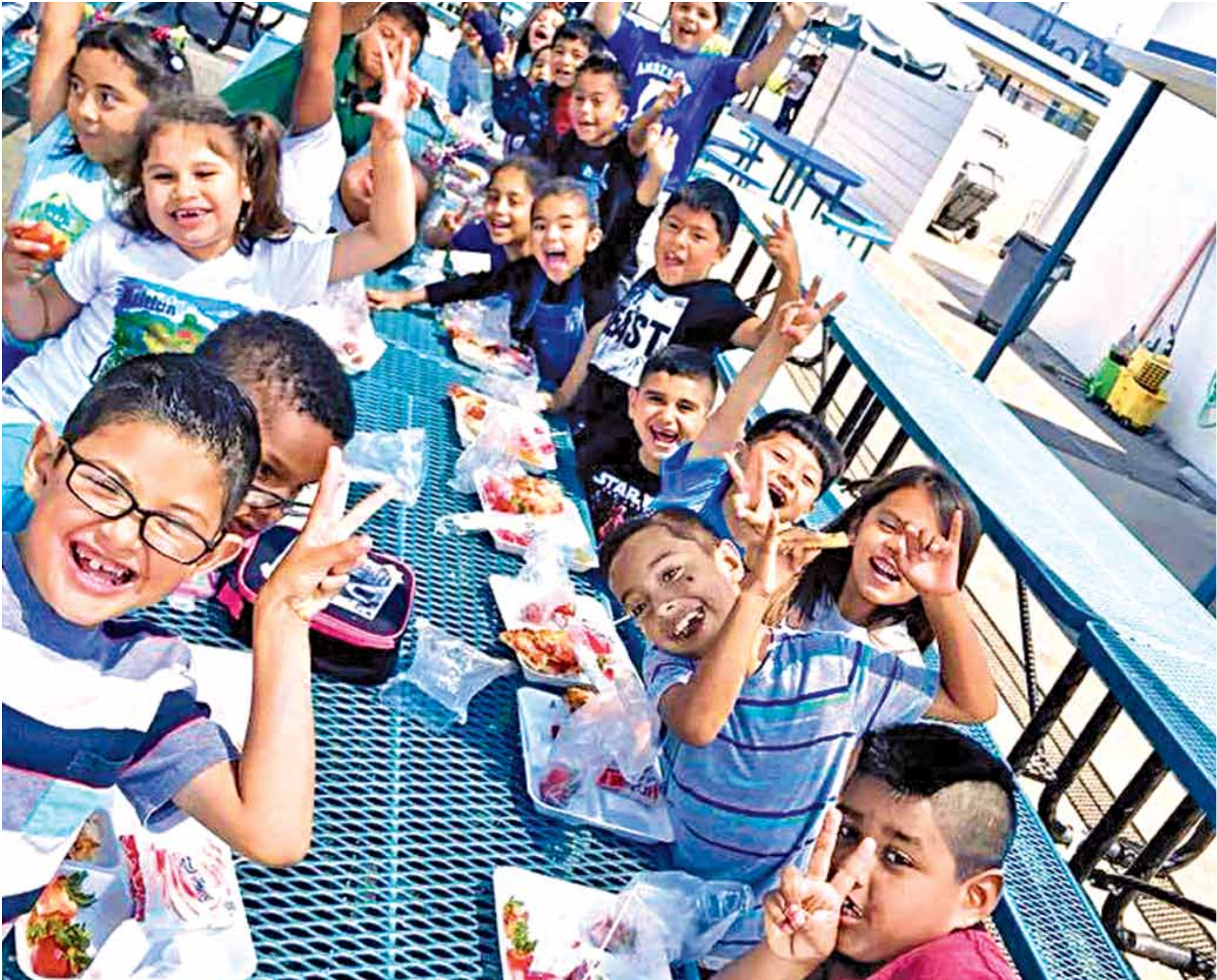
This year, Lawndale Elementary School District (LESD) is introducing a new meal program that will provide free meals for all students. In order to launch this program and keep it alive for years to come, the District is asking for support. To submit an application (deadline is Sept. 21, 2018), go to http://bit.ly/FreeMealsLESD . For information on the program, go to http://bit.ly/LESDfood .