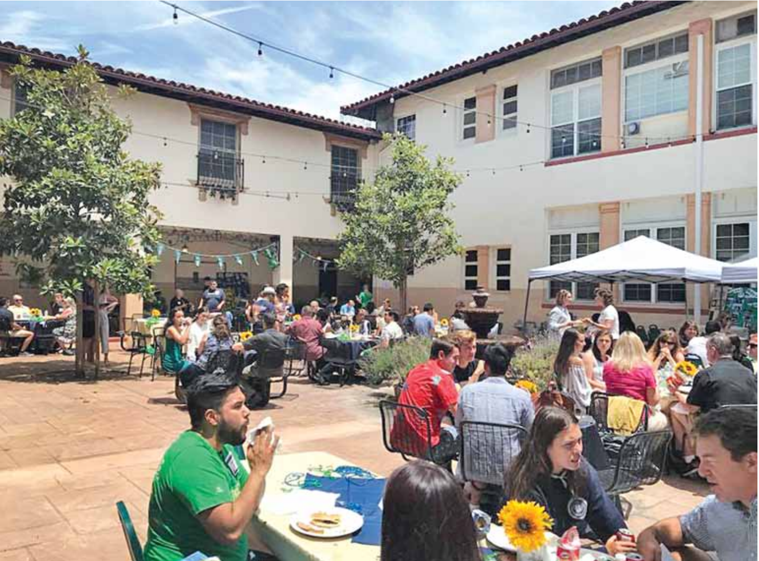
Hawthorne’s Saint Joseph’s School was proud to host the University of Notre Dame’s Los Angeles Alumni Club and the annual new student sendoff last week. Over 30 new freshman at Notre Dame from across LA came together in Saint Joseph’s courtyard to ready themselves for the next four years.