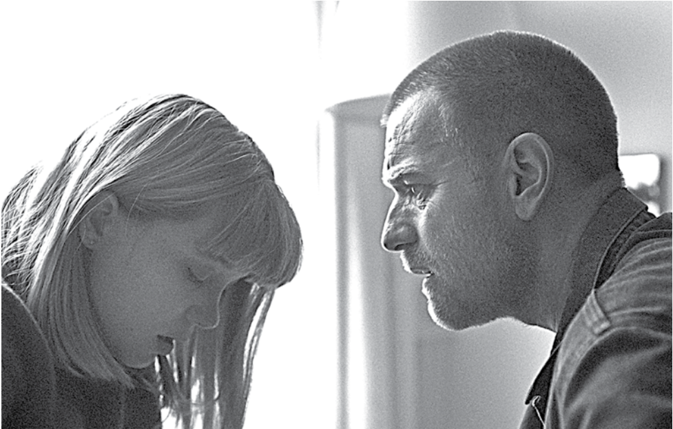
Zoe