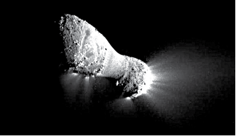
Near-Earth comet 103P/Hartley as seen by NASA's Deep Impact probe.

A CNEOS system called "Sentry" searches ahead for all potential future Earth impact possibilities over the next hundred years-for every known NEO. Sentry's impact monitoring runs continually using the latest CNEOS-generated orbit models, and the results are stored online. In most cases so far, the probabilities of any potential impacts are extremely small, and in other cases, the objects themselves are so small-less than 66 feet across- that they would almost certainly disintegrate even if they did enter Earth's atmosphere. More recently, CNEOS also developed a system called Scout to provide more immediate and automatic trajectory analyses for the most recently discovered objects, even before independent observatories confirm their discovery. Operating around the clock, the Scout system identifies the highest priority objects to be watched. •