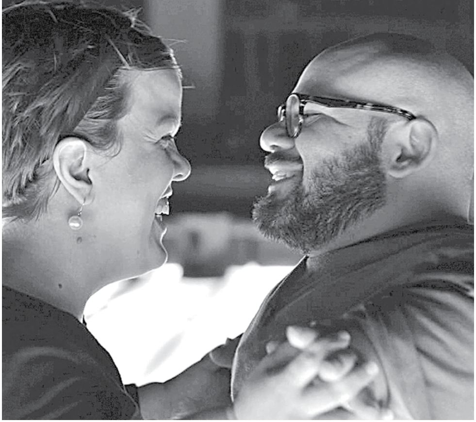
Far From the Tree, Courtesy of IFC Films.

On some level, we are all imperfect. That is what makes us human. The biggest takeaway