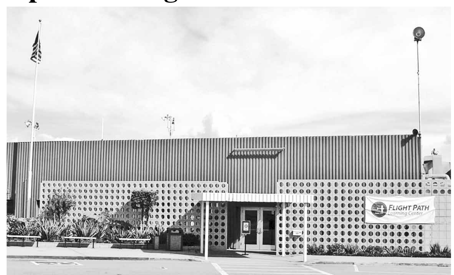
The Flight Path Center and Learning Museum, located at 6661 W Imperial Hwy, will be displaying a collection of memorabilia from the Flying Tigers of World War II. The Flying Tigers were volunteer aviators who later founded the Flying Tiger cargo commercial line. The display will run from August 5 to August 19.