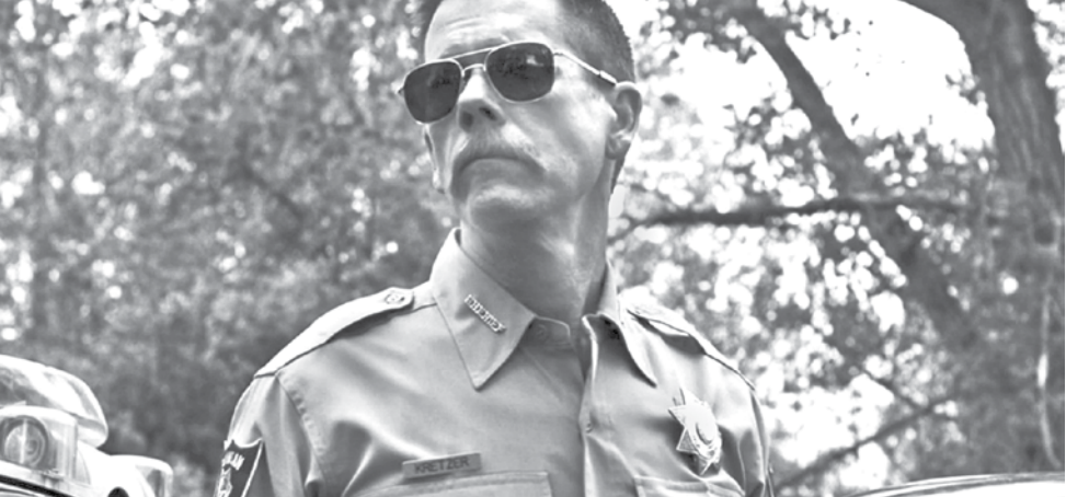
Kevin Bacon in Cop Car.

Cop Car is a reflection of a successfully made, true independent film. With its limited